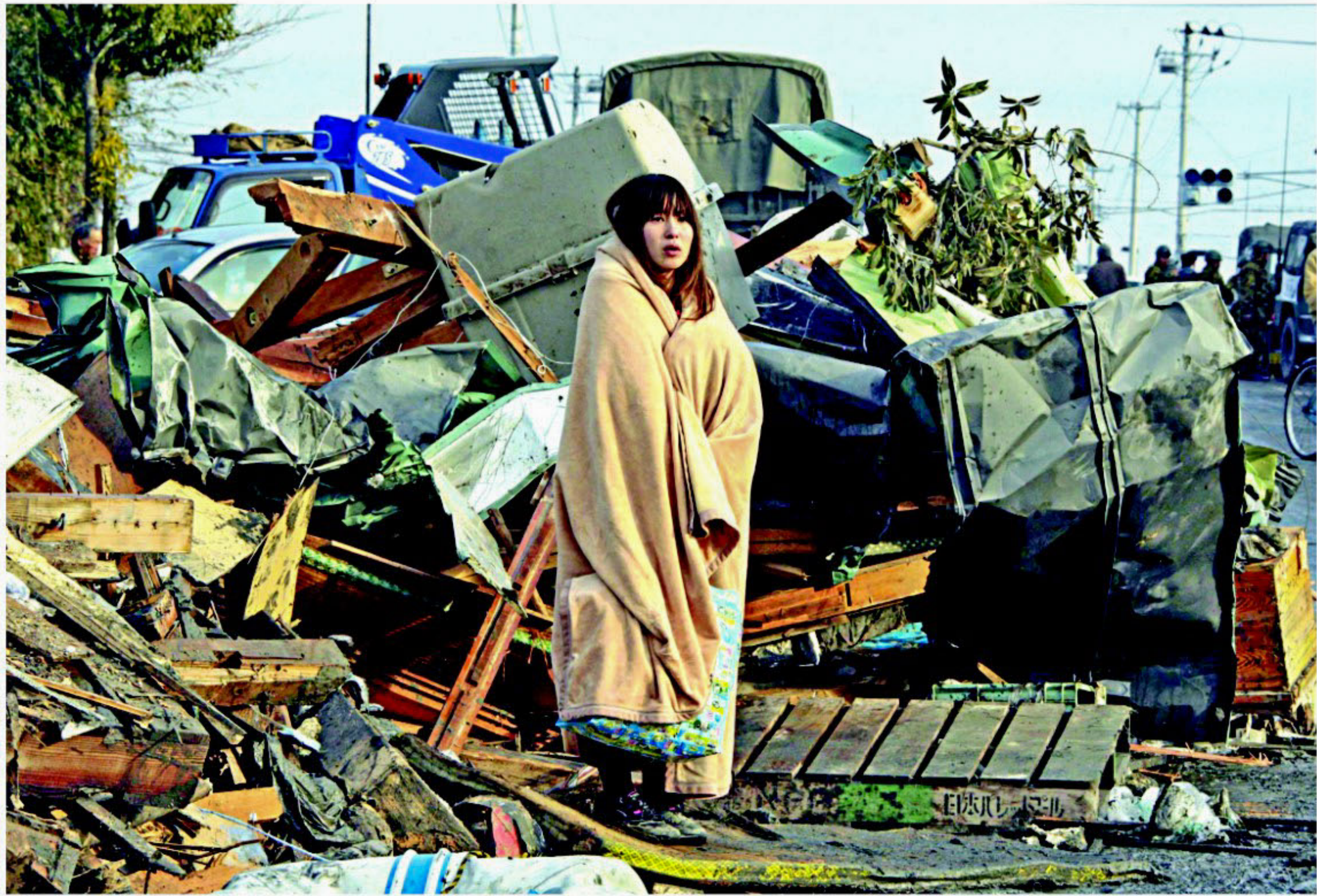
A girl wrapping herself in a blanket looks at the devastation at Ishinomaki city in Miyagi prefecture of Japan yesterday.