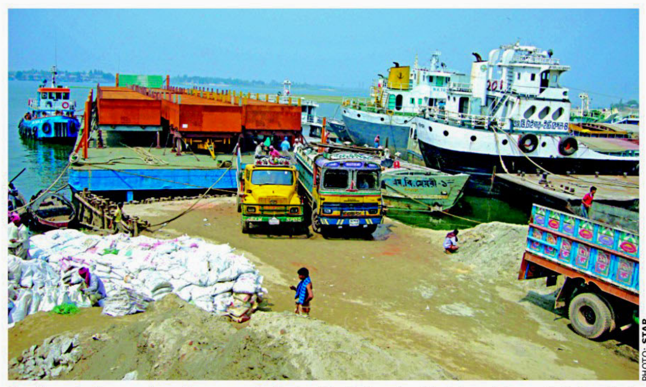
Vessels carrying heavy equipment for a power plant in Agartala of India arrive at the Ashuganj river port in Brahmanbaria. The transshipment of the equipment was agreed upon during Prime Minister Sheikh Hasina's last visit to India.

Say some British MPs, academics DIPLOMATIC CORRESPONDENT Lord Avebury, vice-chair of the UK Parliamentary Human Rights Group, has said the removal of Grameen founder Prof Muhammad Yunus by the government from his post raises serious concerns SEE PAGE 13 COL 8