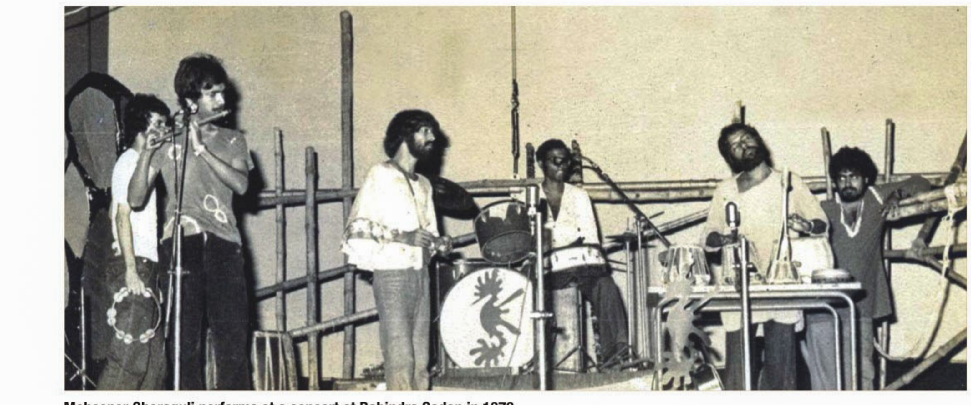
Moheener Ghoraguli performs at a concert at Rabindra Sadan in 1979.