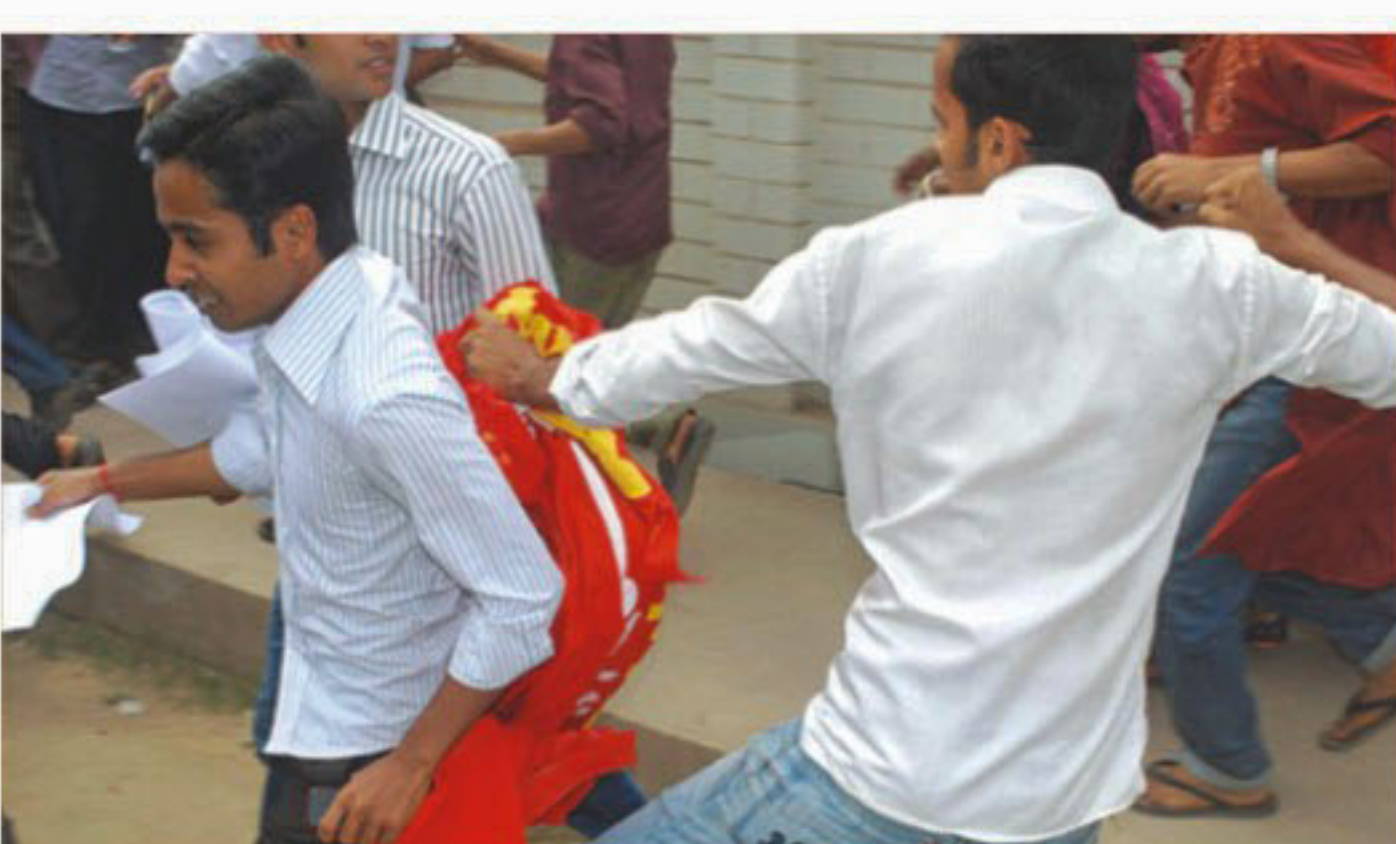
Bangladesh Chhatra League activists man-handle Grameen Bank staff and foil their human chain in front of BM College in Barisal yesterday.