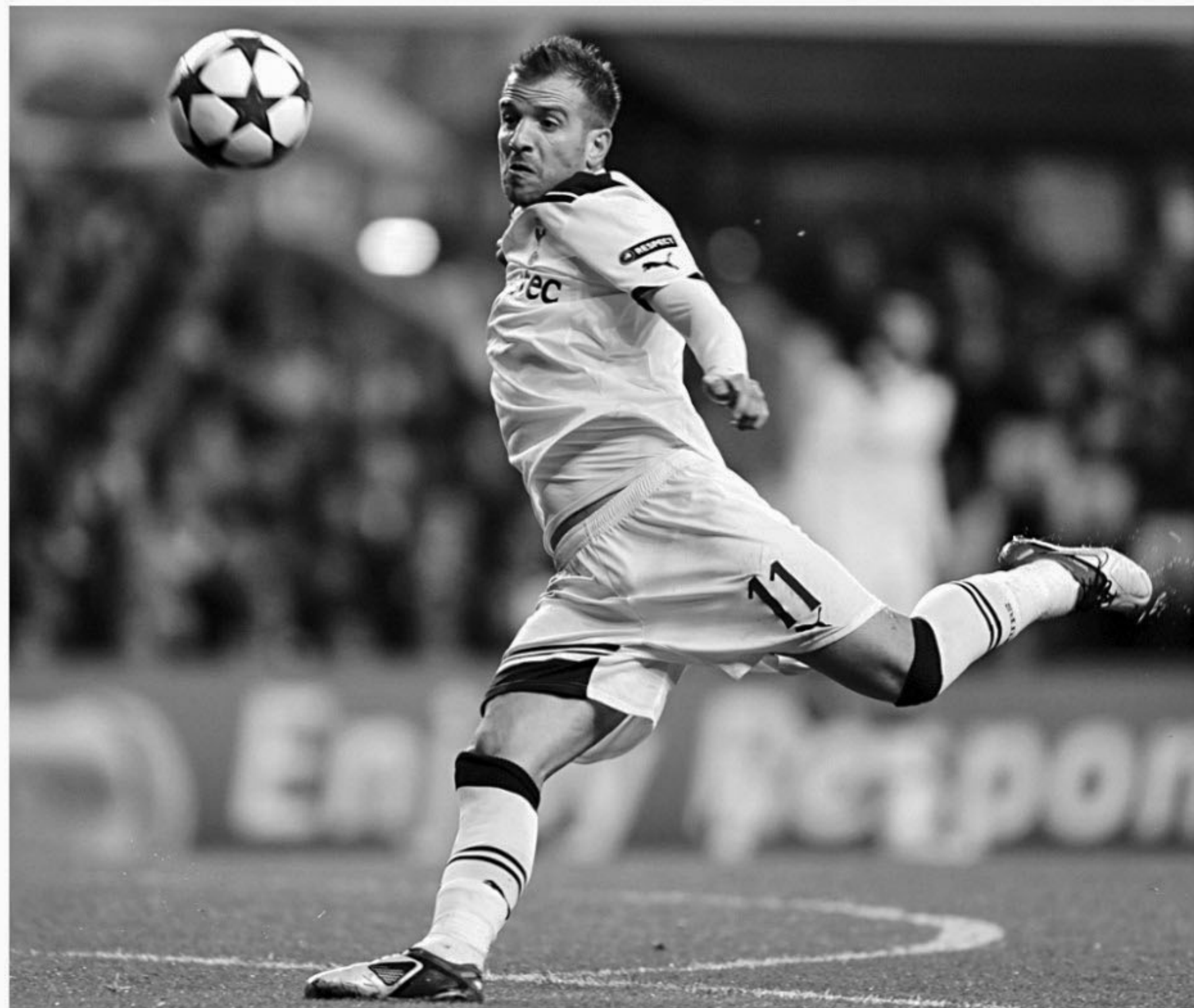
Tottenham Hotspurs midfielder Rafael van der Vaart attempts a volley during their Champions League second round encounter against AC Milan at White Hart Lane on Wednesday.

Pato came desperately close to sending the tie into extra time when his shot whistled past Gomes's near post in the closing minutes but Spurs, who beat Inter Milan in the group stage, had done enough to claim another Italian scalp.