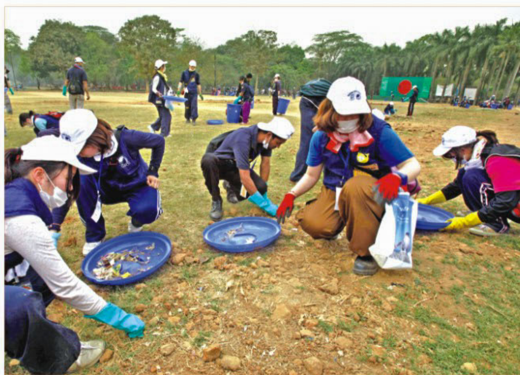
Around 103 students from Japan collect rubbish from Suhrawardy Udyan in the city yesterday under Japan International Cooperation Agency's programme "Mission Clean Dhaka".

The eighth session of the ninth parliament is going on and as per the previous decision it will continue until April 15.