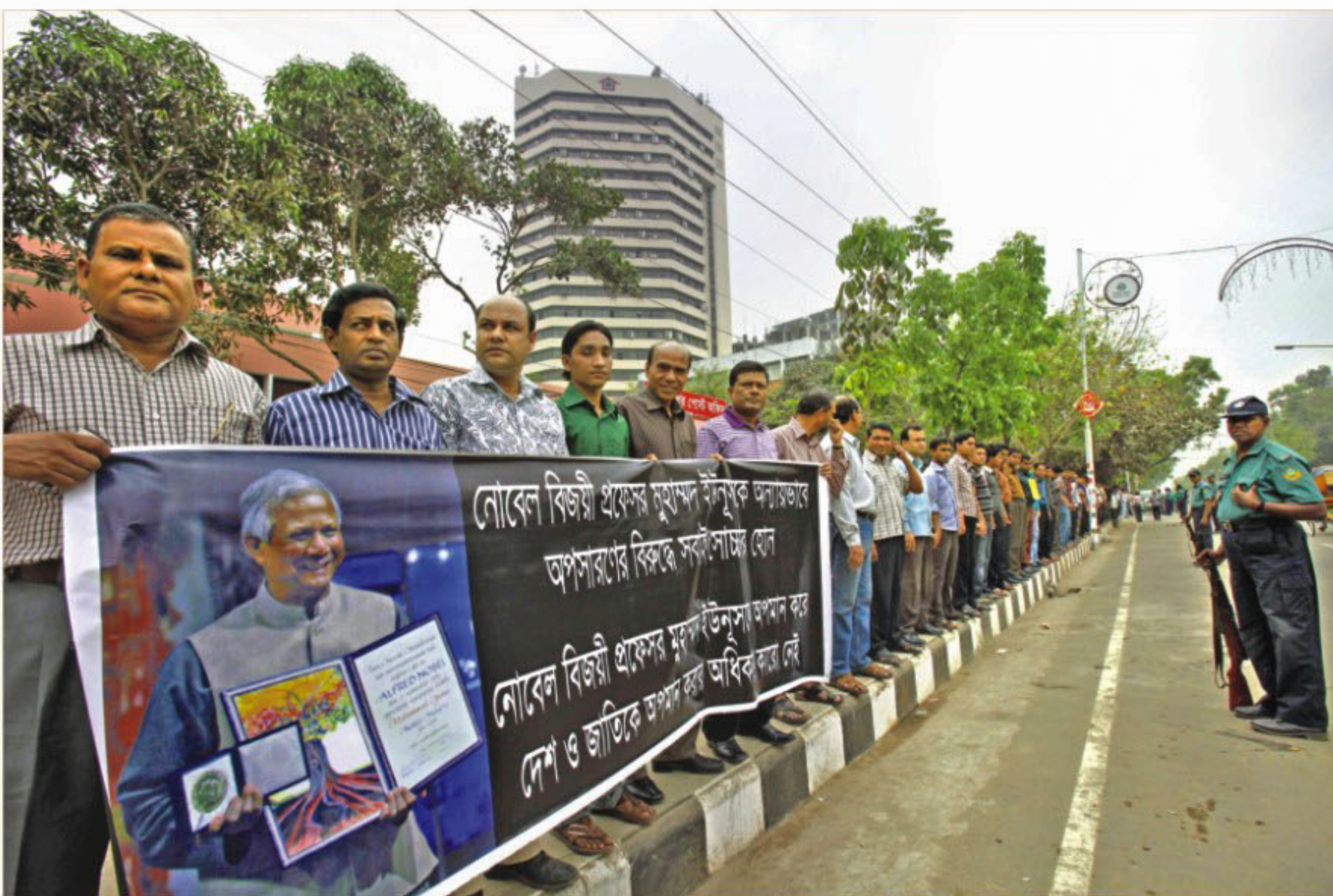
Employees of Grameen Bank form a human chain in front of Grameen Bank office in the city's Mirpur yesterday protesting removal of Prof Yunus from the post of managing director of the bank.