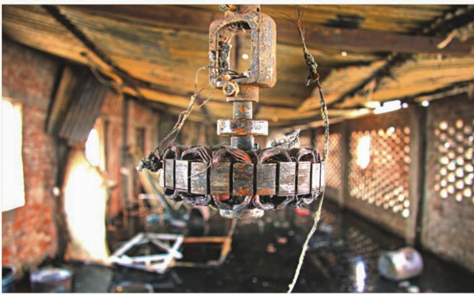
The charred remains of a burned out shed of a factory at Shyampur Industrial area in the capital yesterday.