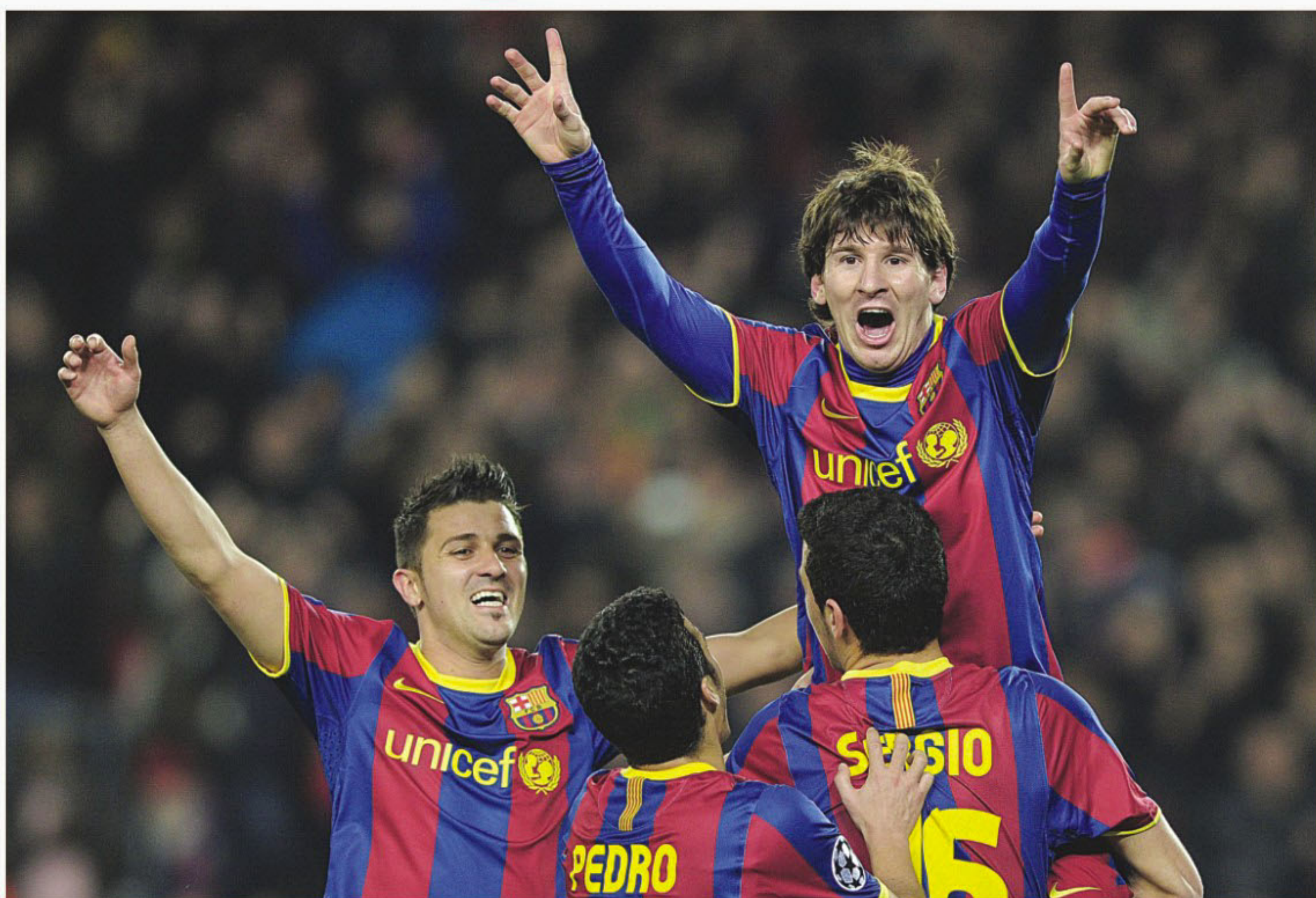
Barcelona superstar Lionel Messi (Top R) is the toast of his teammates after scoring one of his two goals against Arsenal during their Champions League second round encounter at Nou Camp on Tuesday.