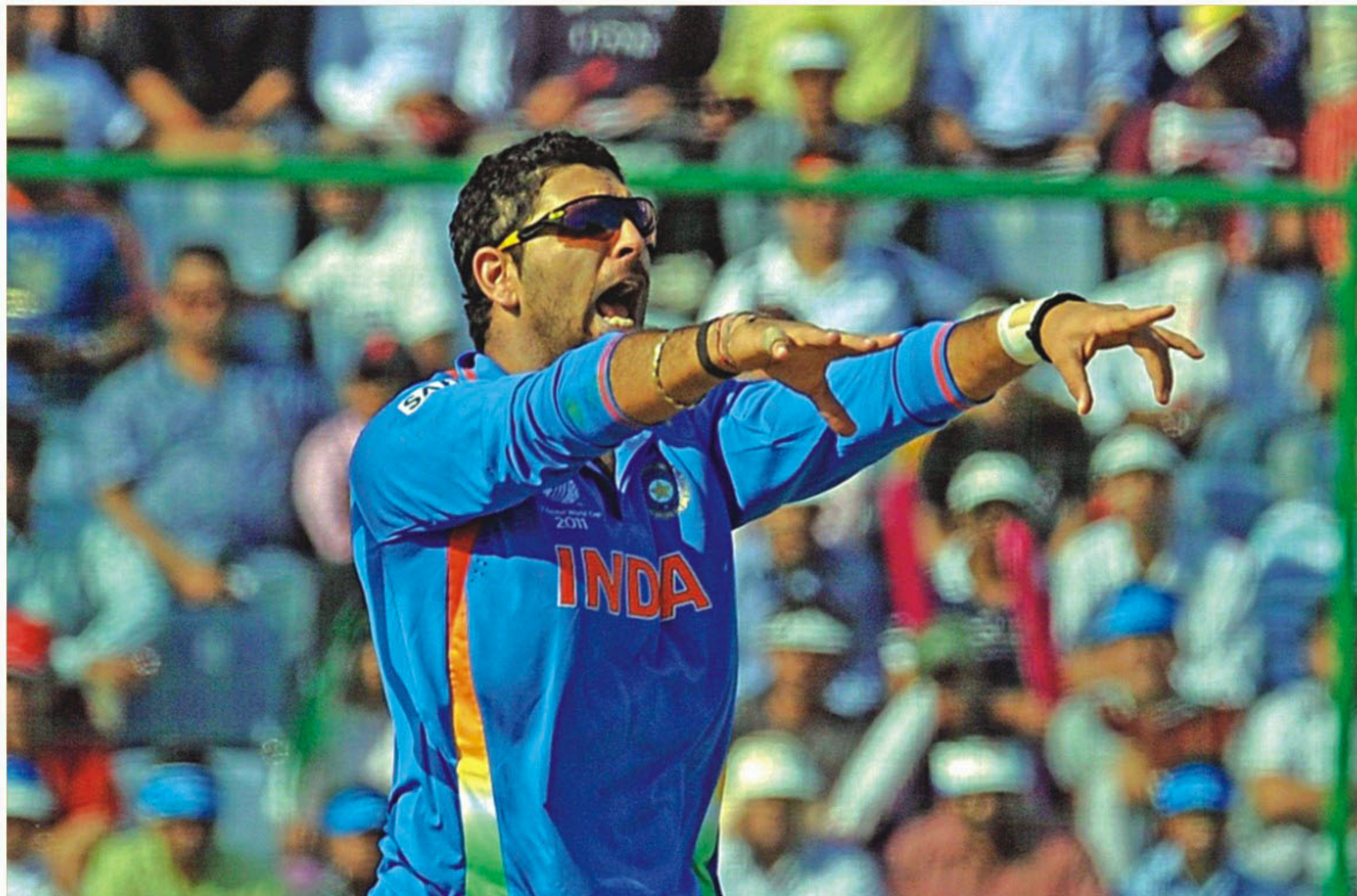
ALL-ROUND SHOW: India player Yuvraj Singh successfully appeals for a leg-before decision against a Netherlands batsman, before taking India home with an unbeaten 51 during their World Cup match in New Delhi yesterday.