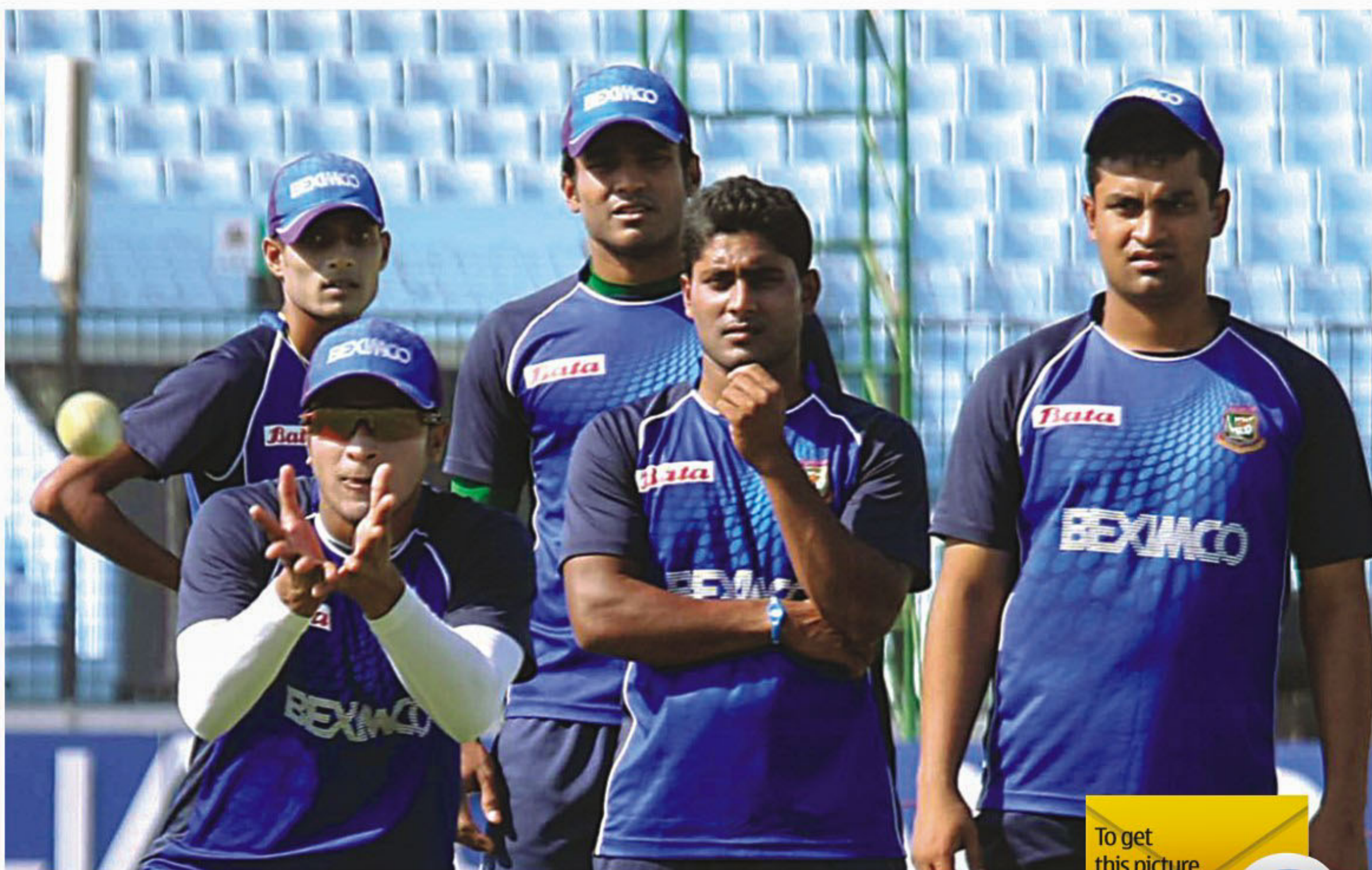
EYES ON THE BALL: Bangladesh captain Shakib AL Hasan is in the act of taking a catch while teammates look on during practice at the Zohur Ahmed Chowdhury Stadium yesterday, ahead of tomorrow's crucial World Cup match against England.