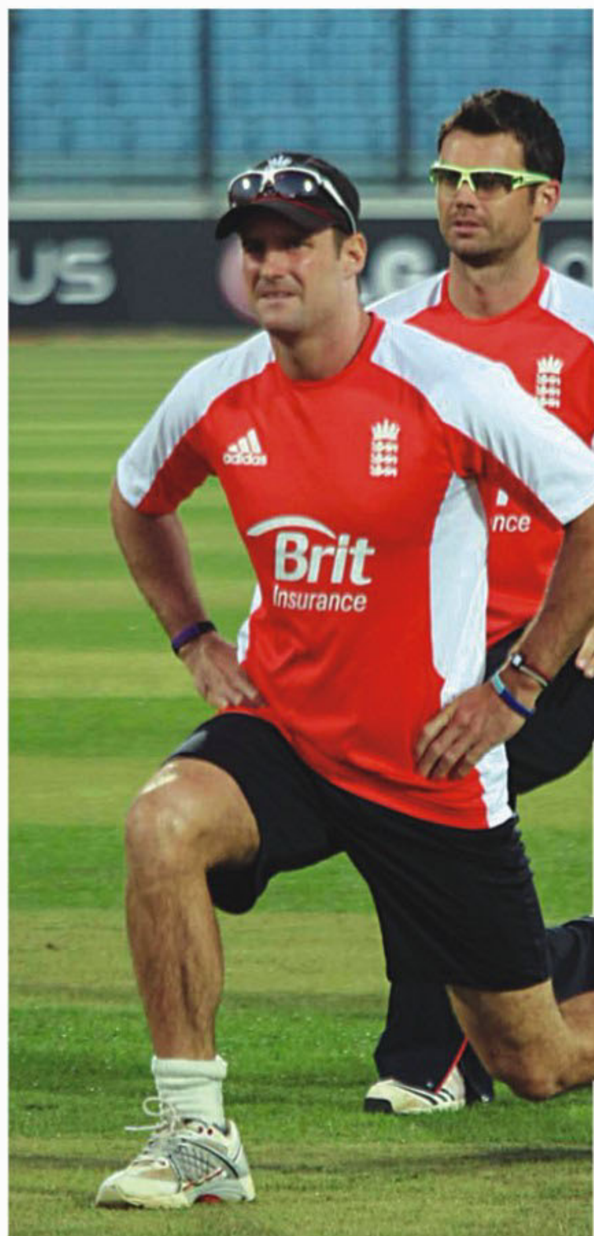
England captain Andrew Strauss (L) and Jimmy Anderson do some lunges as they warm up for their practice session at the Zohur Ahmed Chowdhury Stadium yesterday.