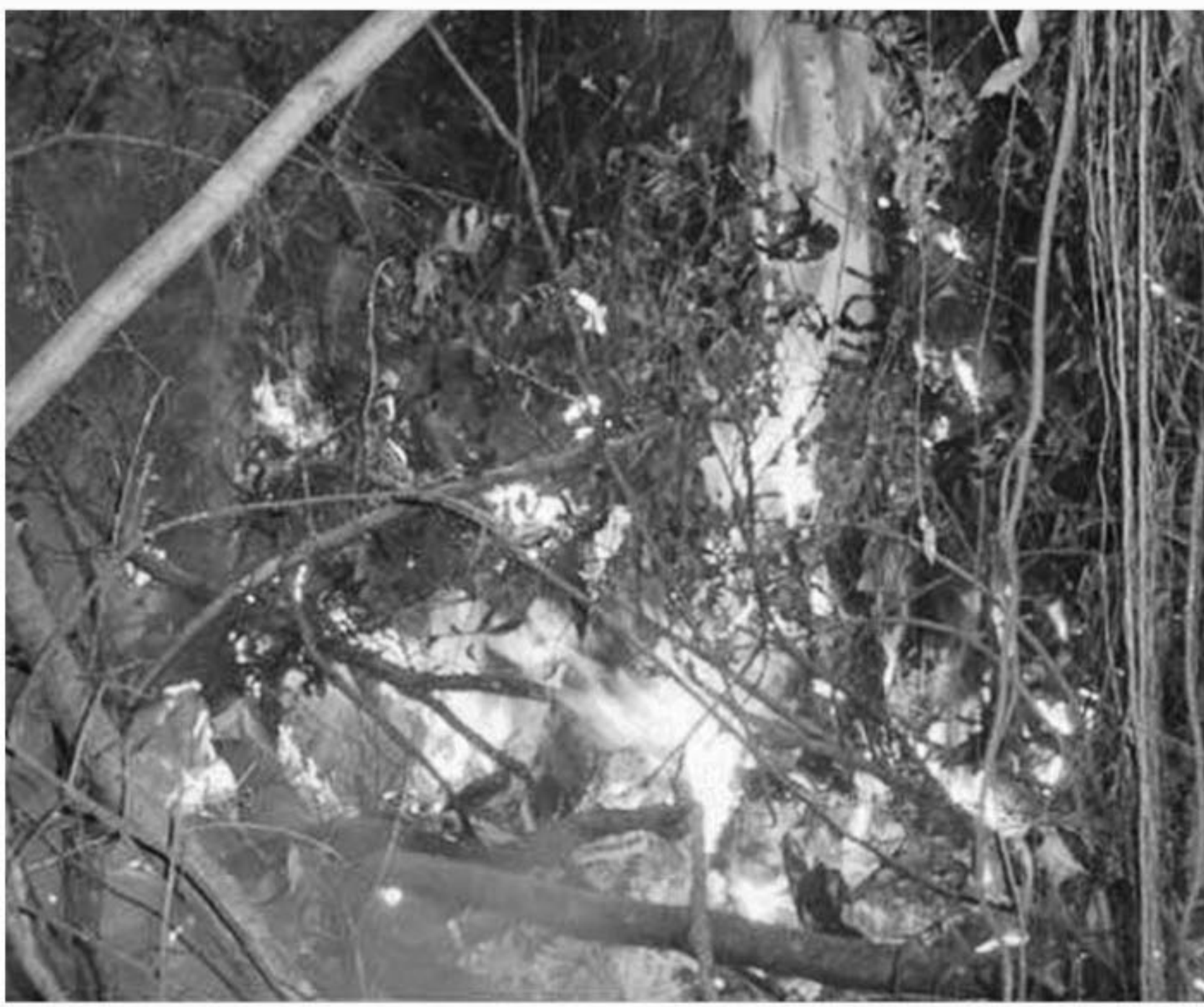
The fire that broke out at compartment No 25 under Chandpai Range of the Sundarbans at Napitkhali in Sharonkhola upazila of Bagerhat district on Tuesday afternoon continued blazing as of filing this report yesterday afternoon.