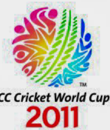
ICC Cricket World Cup 2011

Chasing a modest 207 to win, India lost explosive opener Virender Sehwag (5) in the second over, with Trent Johnston (2-16) pouncing a simple return catch. Gautam Gambhir (10) followed suit with