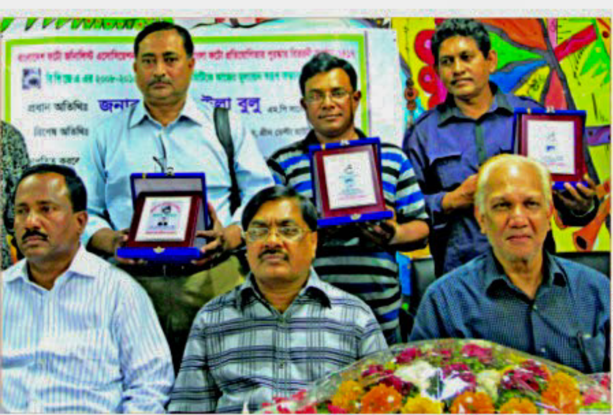
Winners of Ruposhi Bangla Photo Contest organised by Bangladesh Photojournalists Association pose for photograph with guests after the awarding ceremony at the association's auditorium in the city yesterday.