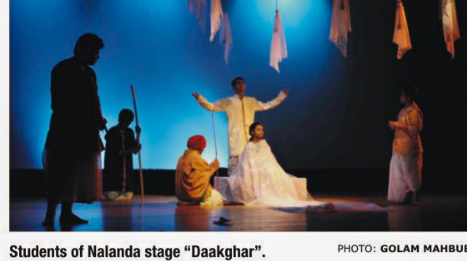
Students of Nalanda stage "Daakghar".

The seventh and final phase will be held from May 7 to 9, 2011 at the Shawkat Osman Auditorium, Central Public Library in Dhaka.