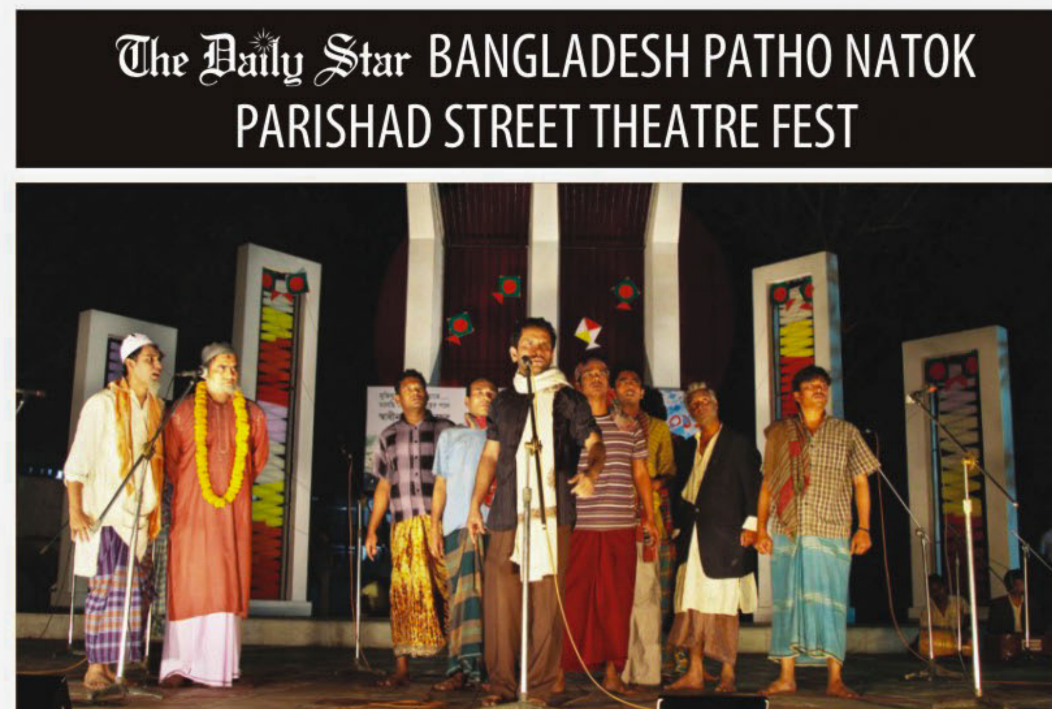
Actors of Rokku Smriti Parishad (Tangail) and Centre for Bangladesh Theatre staged their respective productions "Pherari Nishan" and "Nishobdo" at the Central Shaheed Minar premises, on March 3.

The staging was part of the ongoing Bangladesh Street Theatre Festival '11, jointly arranged by Bangladesh Patho Natok Parishad and The Daily Star. Seven plays were staged on the day.