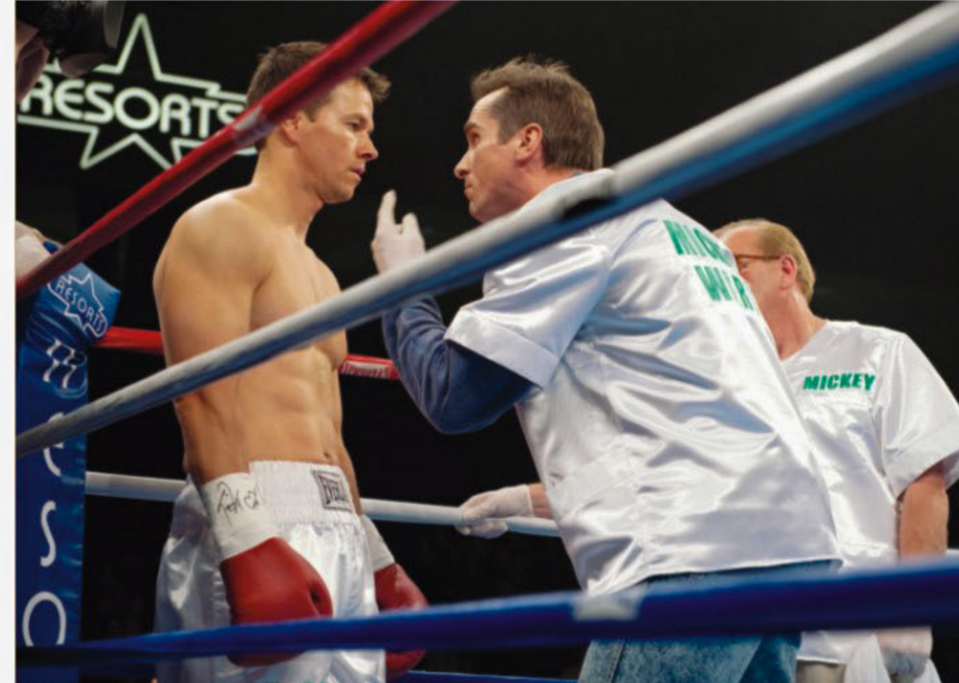
A scene from "The Fighter".