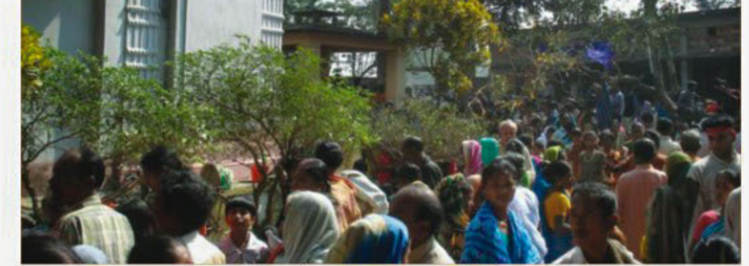
The devotees began thronging the temple from 10pm onwards on Tuesday night.

Amidst the recitation of 'shlokas' (Sanskrit verses) and chants, people waited for over two to three hours for their turn to enter the shrine