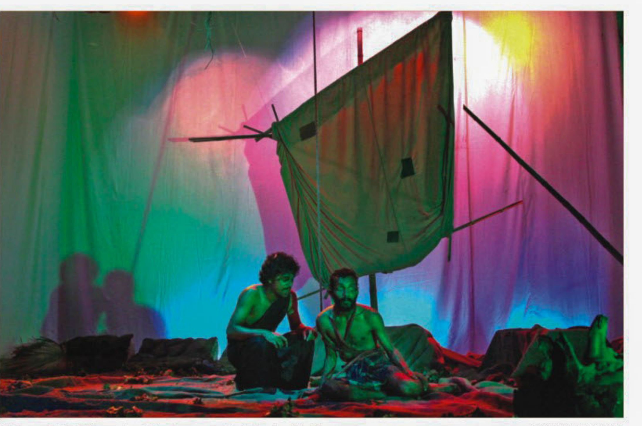
"Ujaney Mrittu" marked the inaugural of the festival.

Telecom operator Robi is the sponsor of the festival.