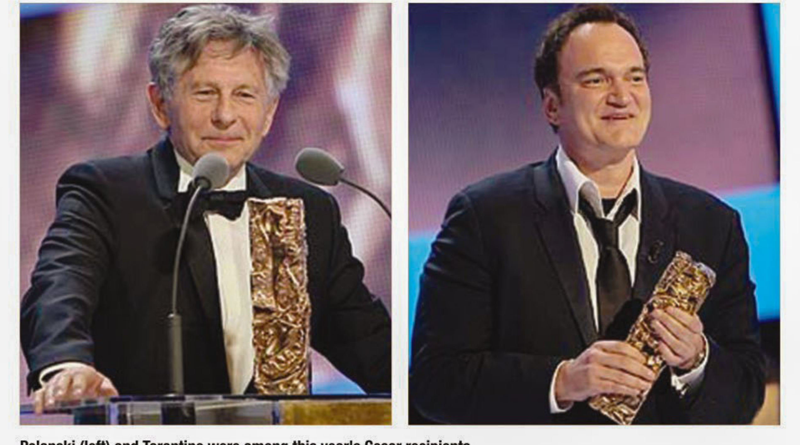
Polanski (left) and Tarantino were among this year's Cesar recipients.