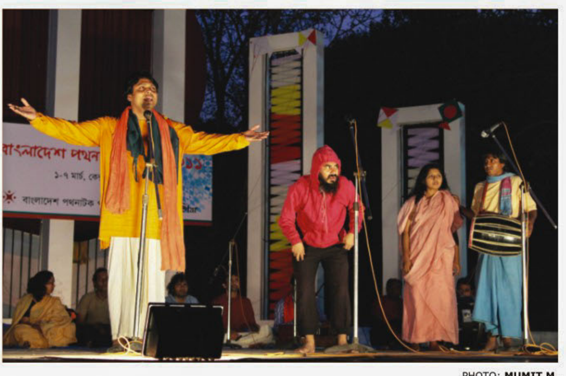
Clockwise (from top-left): Scenes from the plays "The Mad", "Dahon" and "Khekshial".