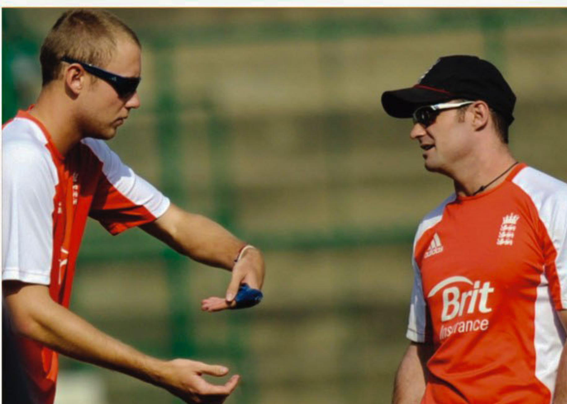
TEACH ME HOW TO BAT: England paceman Stuart Broad (L) is in conversation with his captain Andrew Strauss at the Chinnaswamy Stadium where the left-hander scored a magnificent 158 against India in a World Cup match that ended in a tie on Sunday.