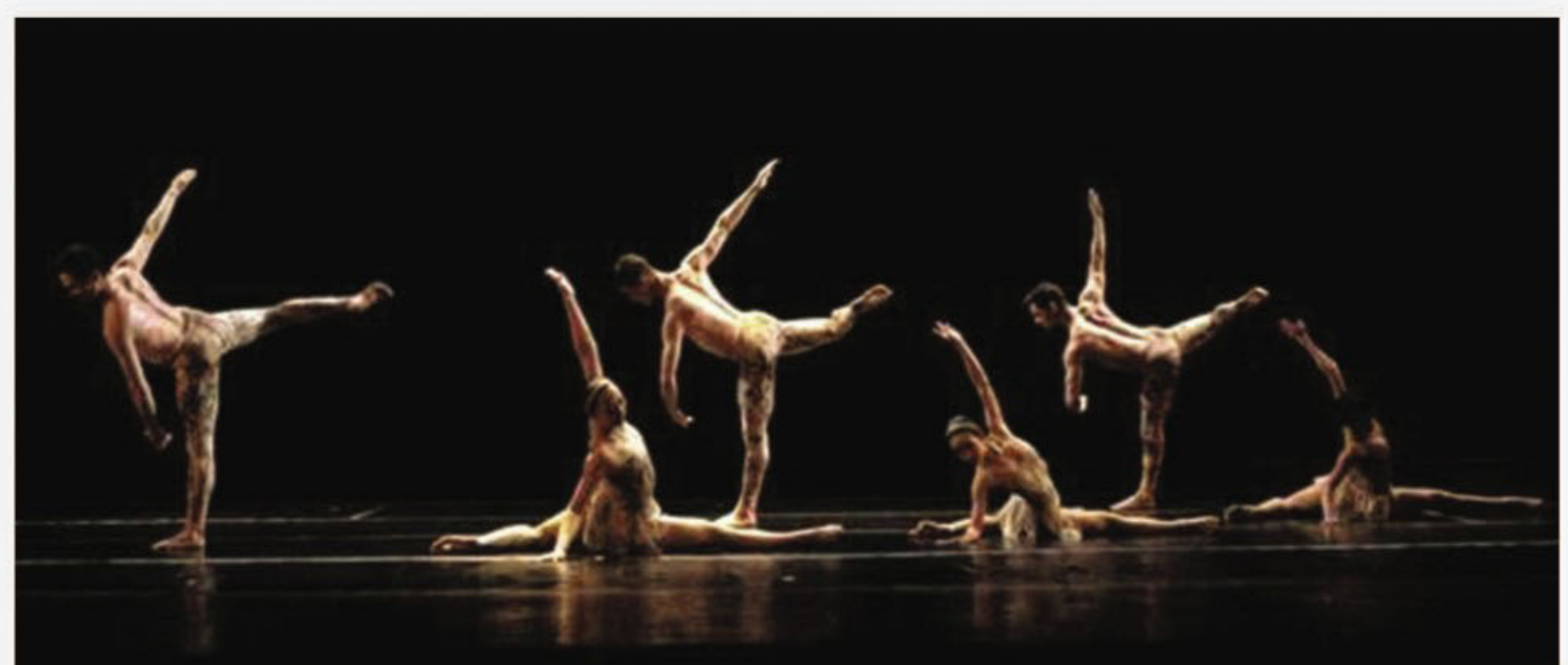
Performance by Paul Taylor 2 company.