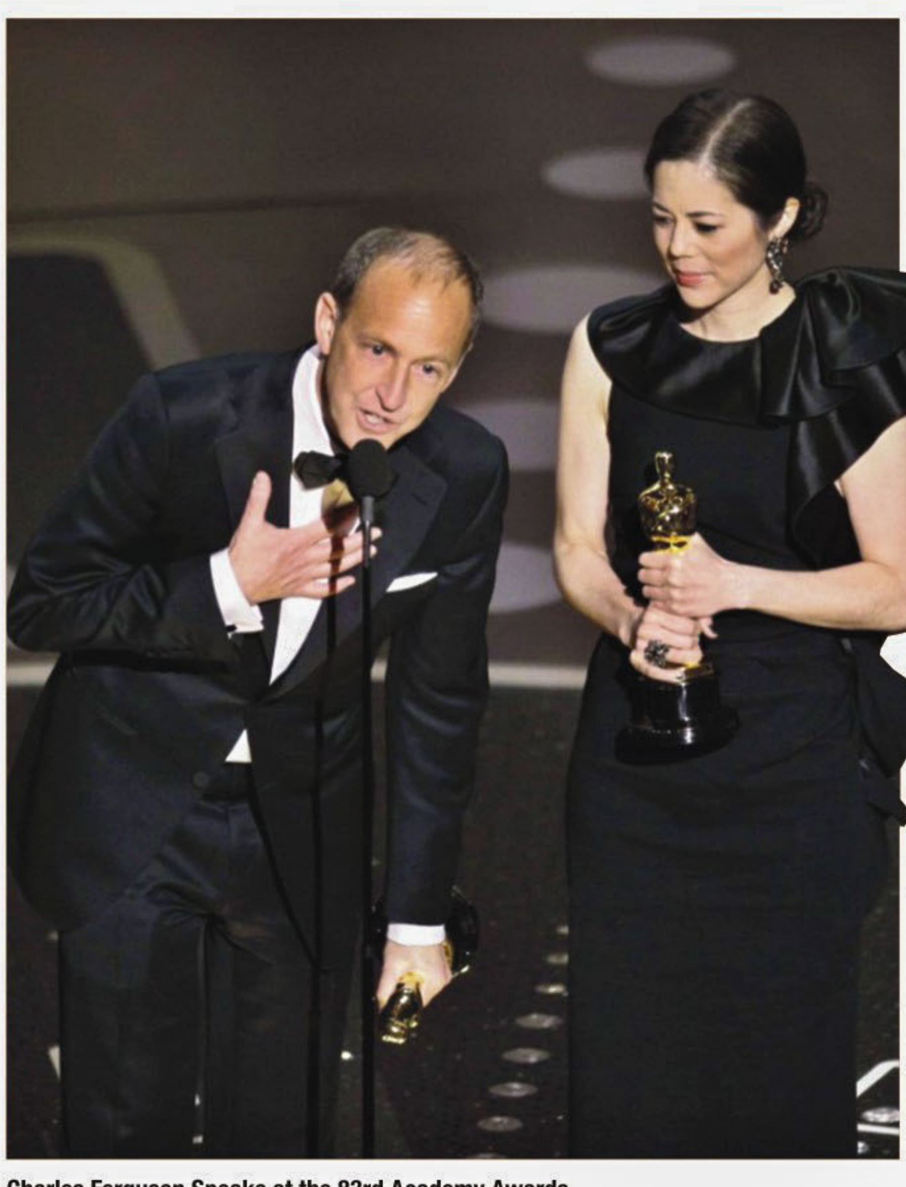
Charles Ferguson Speaks at the 83rd Academy Awards.

"Forgive me," said filmmaker Charles Ferguson upon receiving an Academy Award on Sunday night for his documentary "Inside Job." "I must start by pointing out that three years after a horrific financial crisis caused by fraud, not a single financial executive has gone to jail and that's wrong." "Inside Job", a searing assault on the banking industry and its role in the financial meltdown of 2008, has won the ultimate accolade from the film world: the Oscar for best documentary. Charles Ferguson, who became a filmmaker after making millions developing internet software, had lost out at the Oscars before, when his 2007 film about the Iraq war, "No End in Sight", was nominated, but this time he had a happy ending. "Inside Job", which premiered at the Cannes film festival in 2010, traces the connections between government and financial institutions, as well as theoretically independent academics, showing how they combined to trigger excessive profit-taking and endanger the wider economy. With this victory, "Inside Job" has outperformed an equally devastating attack on American politics, Michael Moore's "Fahrenheit 9/11". Moore's movie was not even nominated. Source: Internet