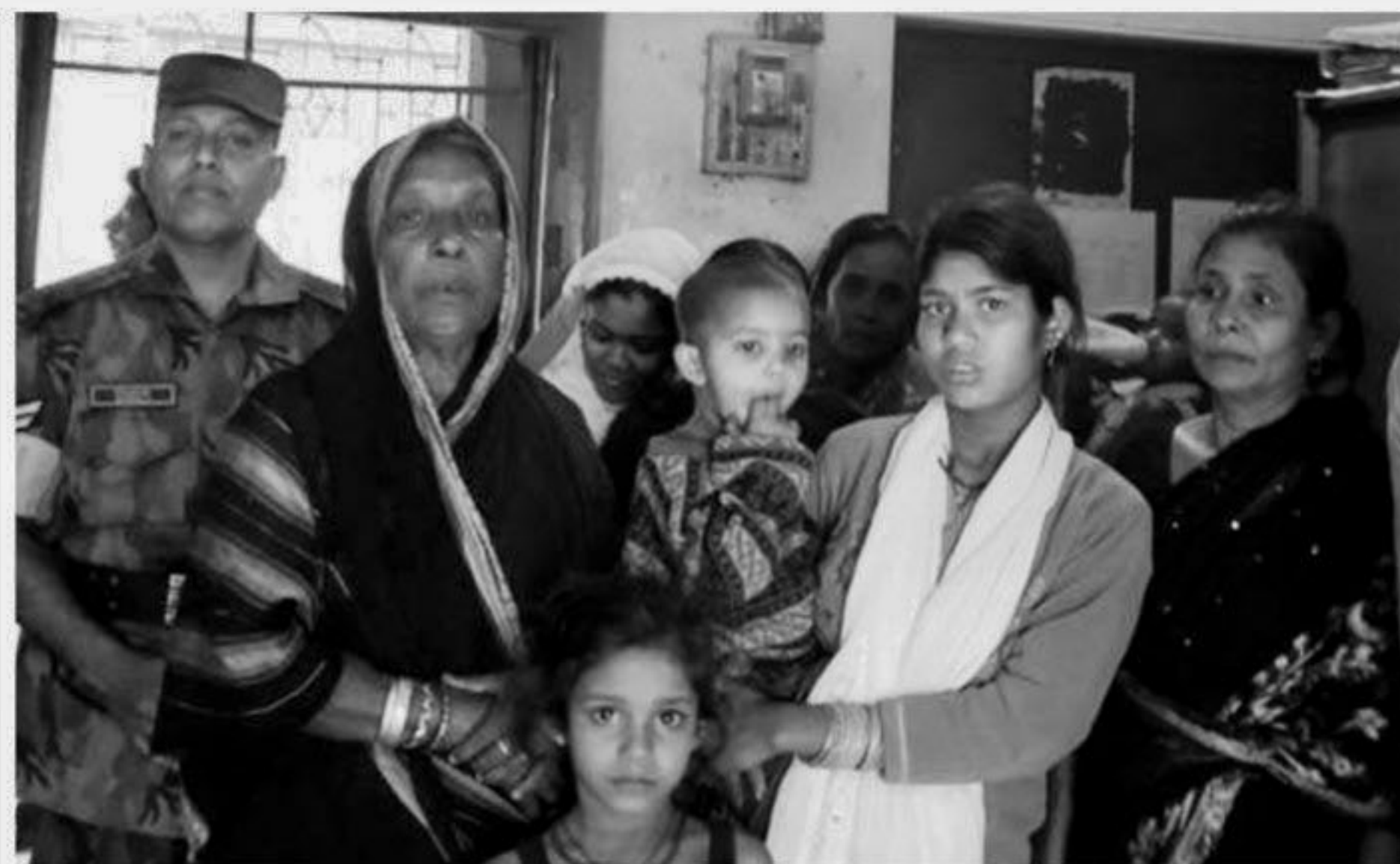
Border Guard Bangladesh rescue seven children, eight women and seven men when they were being trafficked to India through Bara Achra border near Benapole land port yesterday. The traffickers, however, managed to escape sensing presence of the law enforcers.