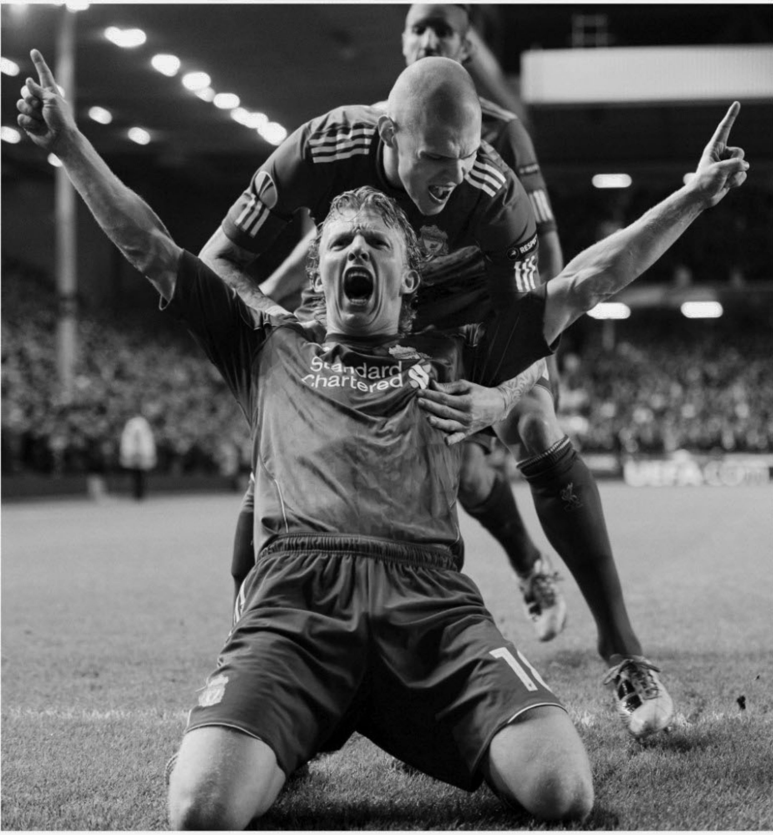
Liverpool striker Dirk Kuyt (C) is ecstatic after scoring the tie-winning goal against Sparta Prague during their Europa League encounter at Anfield on Thursday.