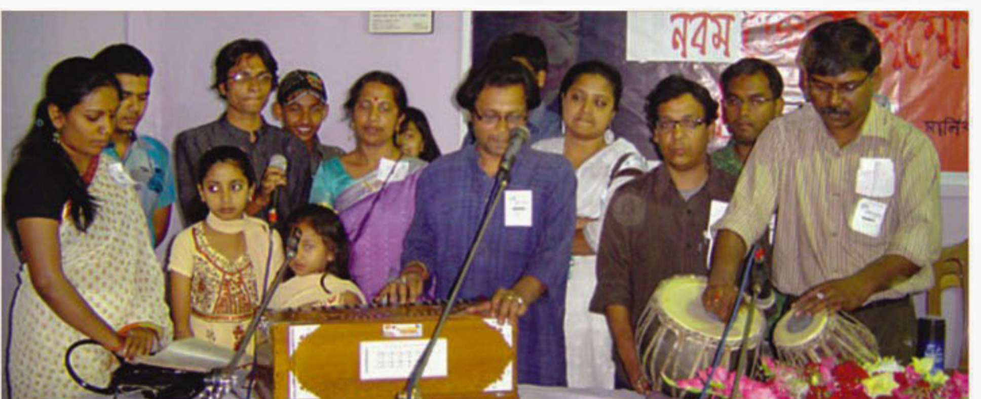
Artists perform at the programme.

Later a cultural function was held there after declaration of the names of the committee members.