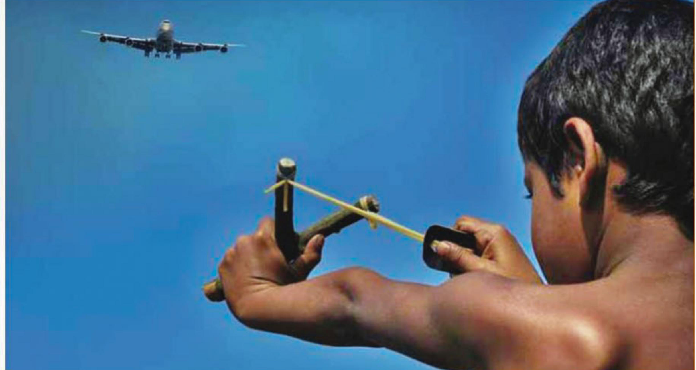
A scene from "Runway".

Director Tareque Masud was present on the opening day. He also met with the university teachers and discussed film-related issues.