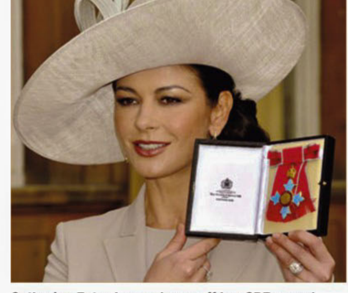
Catherine Zeta-Jones shows off her CBE award.

Wales-born Hollywood star Catherine Zeta-Jones has been knighted by Prince Charles for her contribution to cinema and was made a Commander of the British Empire (CBE) in a ceremony in London.