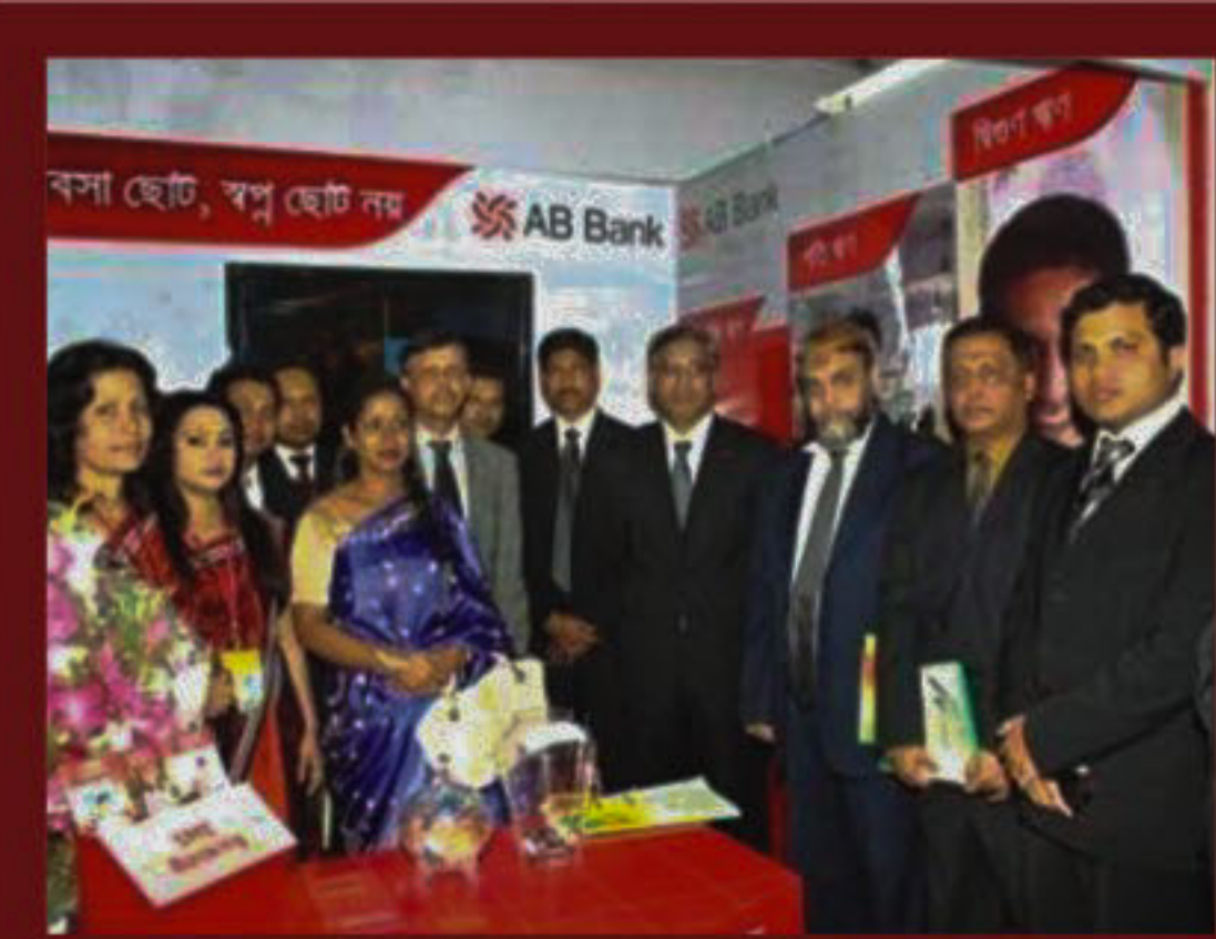
AB BANK Officials of AB Bank pose at the bank's stall at SME Financing Fair-2011, jointly organised by SME Foundation and Bangladesh Bank, in the capital recently.