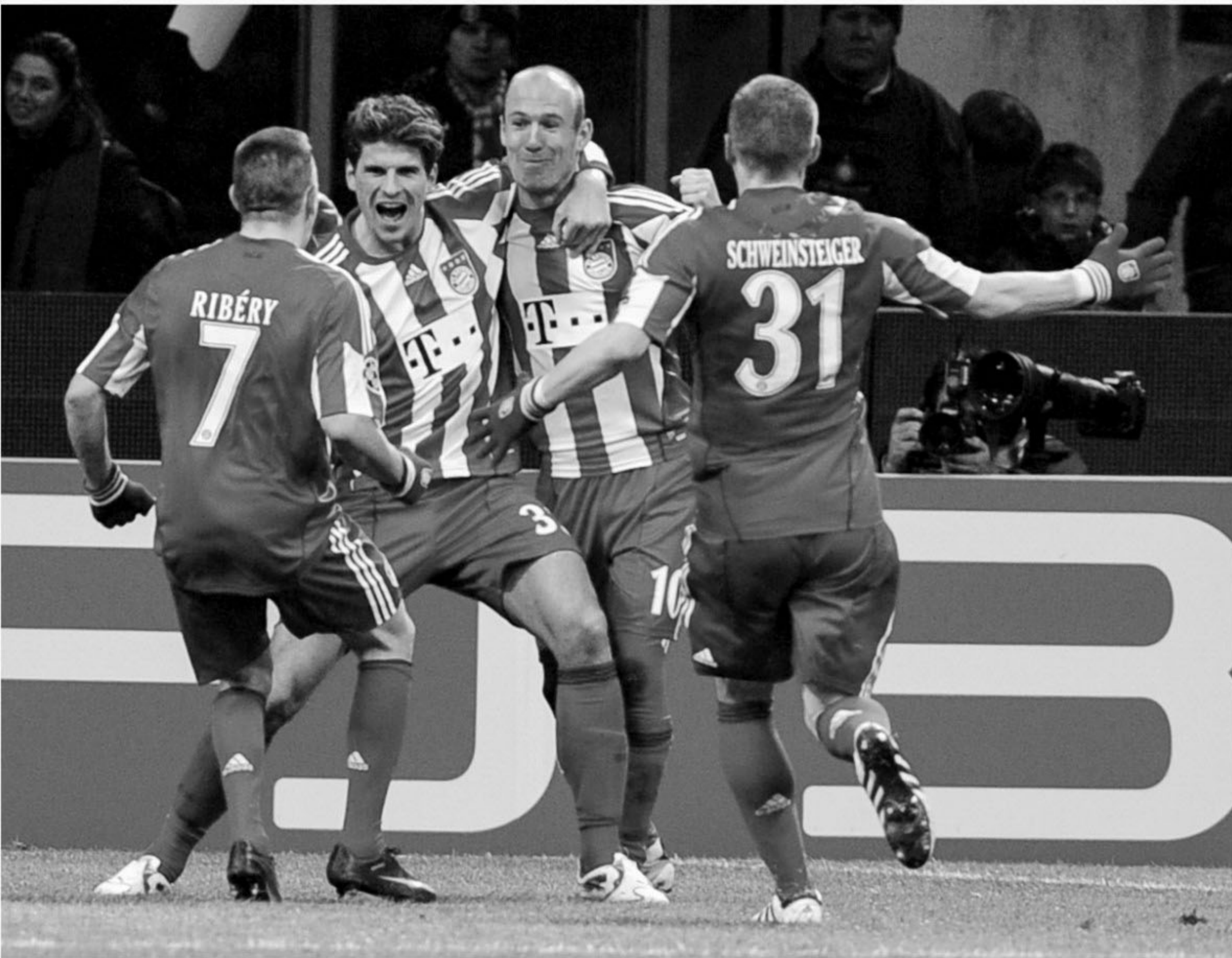
Bayern Munich striker Mario Gomez (2nd from L) celebrates his all-important goal with teammates during their Champions League encounter against Inter Milan at San Siro on Wednesday.