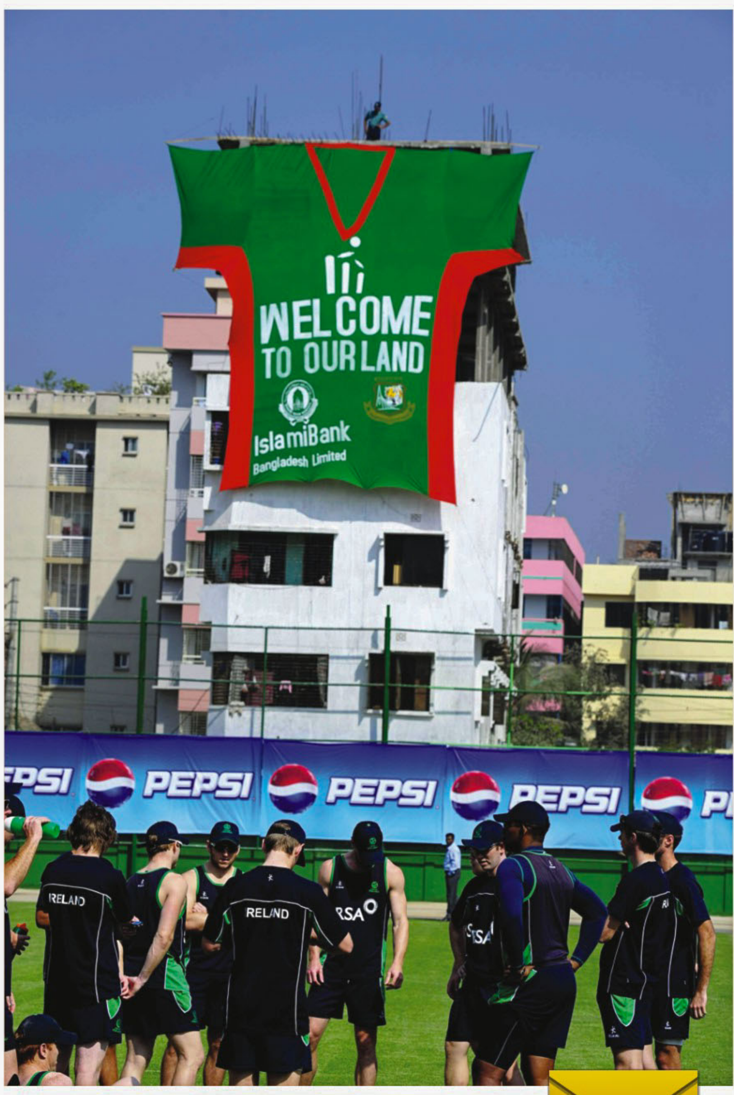
DIFFERENT SIZES, SAME ZEAL: From human torsos via mannequins to buildings, cricket fever has spread like wildfire. A building overlooking the GP-BCB Cricket Academy Ground in Mirpur, where the Ireland team practised yesterday, has been draped in the Tigers' jersey.

piece event. The world's number one all-rounder was also not ready to brand Ireland an underdog and the whispering was all around that Bangladesh will face a stiff challenge from the Irish side; not only because that they had a sweet memory against the Tigers in the last World Cup but also because they had acclimatized well with the subcontinent conditions. So, the obvious question was whether Bangladesh was under pressure? Shakib however dismissed the notion. "There is no pressure. We are looking forward to the match," said a confident sounding Shakib. But he was quick to take into account the importance of the match for them. "It's a must win situation for us because we have to win the match if we want to qualify for the second round. It will be really difficult for us if we lose the game," he observed. The young Bangladesh skipper however said that his side was ready to take the challenge. "The boys are up and the preparation is really good. We don't have any different planning against Ireland rather we need to play our normal game which would be good enough for us to win the match. We must stick to our game plan and make sure that we execute it in the middle," said Shakib adding that they failed to execute the plan while bowling against India but the fielding and batting was quite satisfactory. When Bangladesh played against India, the talking point was whether they can