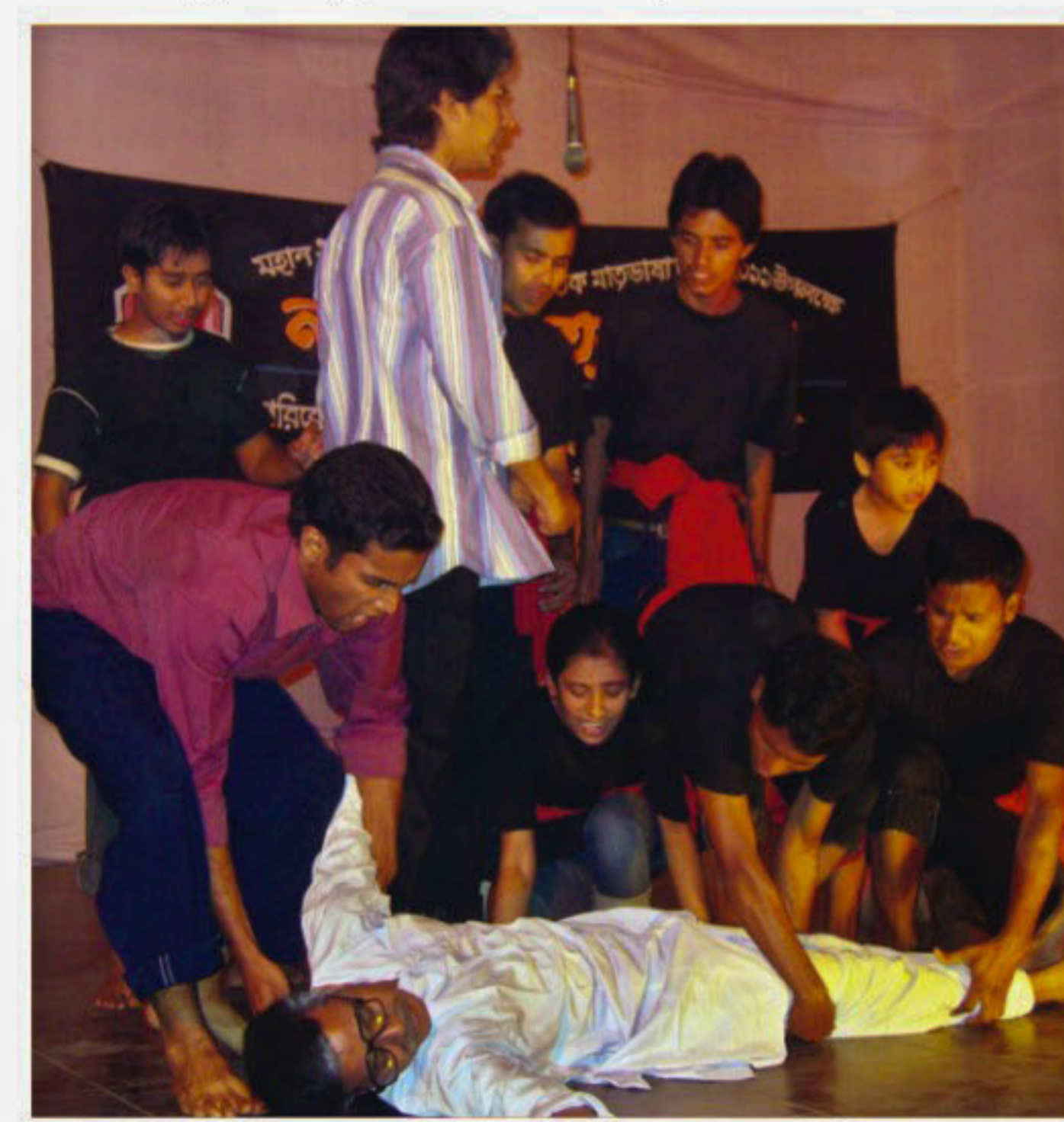
A scene from "Shahidera Kotha Boley".