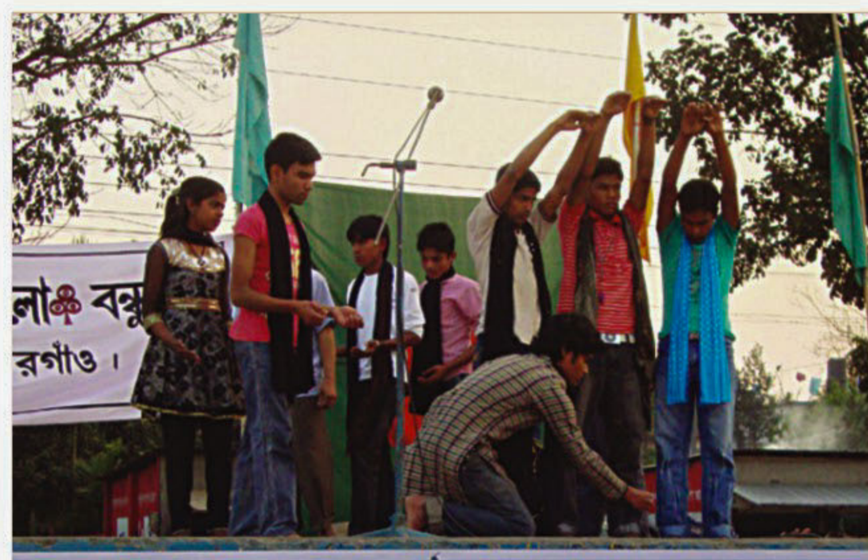
A scene from "Ekusher Chetona Shudhu Ekti Diner Noy".

have reached a new level as the tournament is at our doorsteps and I can't wait to hear Sakib and his golden boys roar like tigers on the field. Although the first match disappointed me a bit, I haven't lost hope yet. I don't know who will be crowned champions, but I sure wish that Bangladesh will be able to lift the silverware this year. My second favorites are India. I was there at the stadium in Malaysia when Bangladesh won the ICC Trophy in 1997. The experience brought tears to my eyes and I hope for a repetition of such a feat."