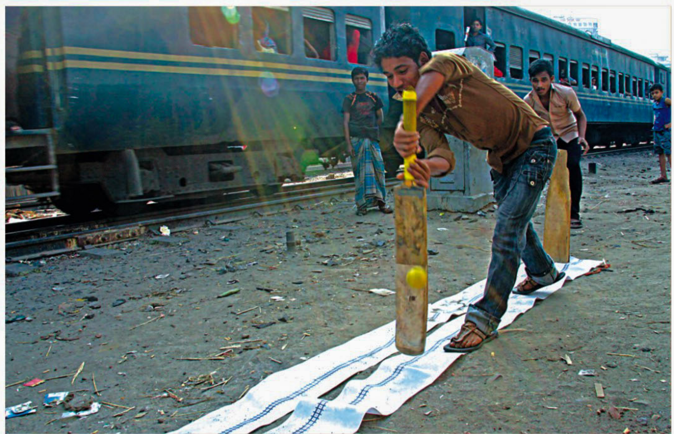
So what if there is no cricket ground or a pitch or any proper gear, the World Cup fever is here and spreading. The photo was taken at Karwan Bazar in the capital yesterday.