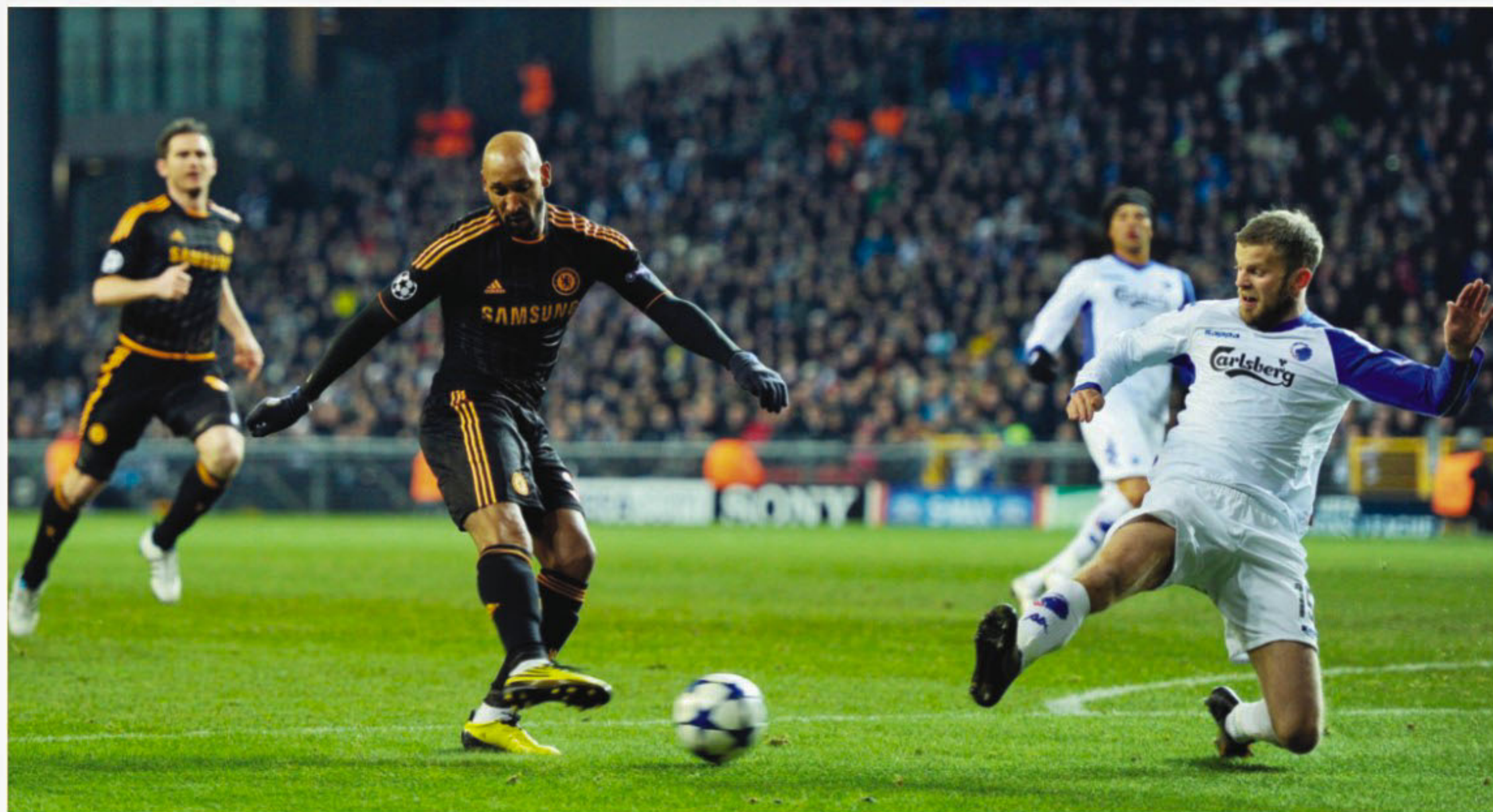
Chelsea striker Nicolas Anelka (C) shoots to score the opening goal against FC Copenhagen during their Champions League second round encounter at the Parken Stadium on Tuesday.