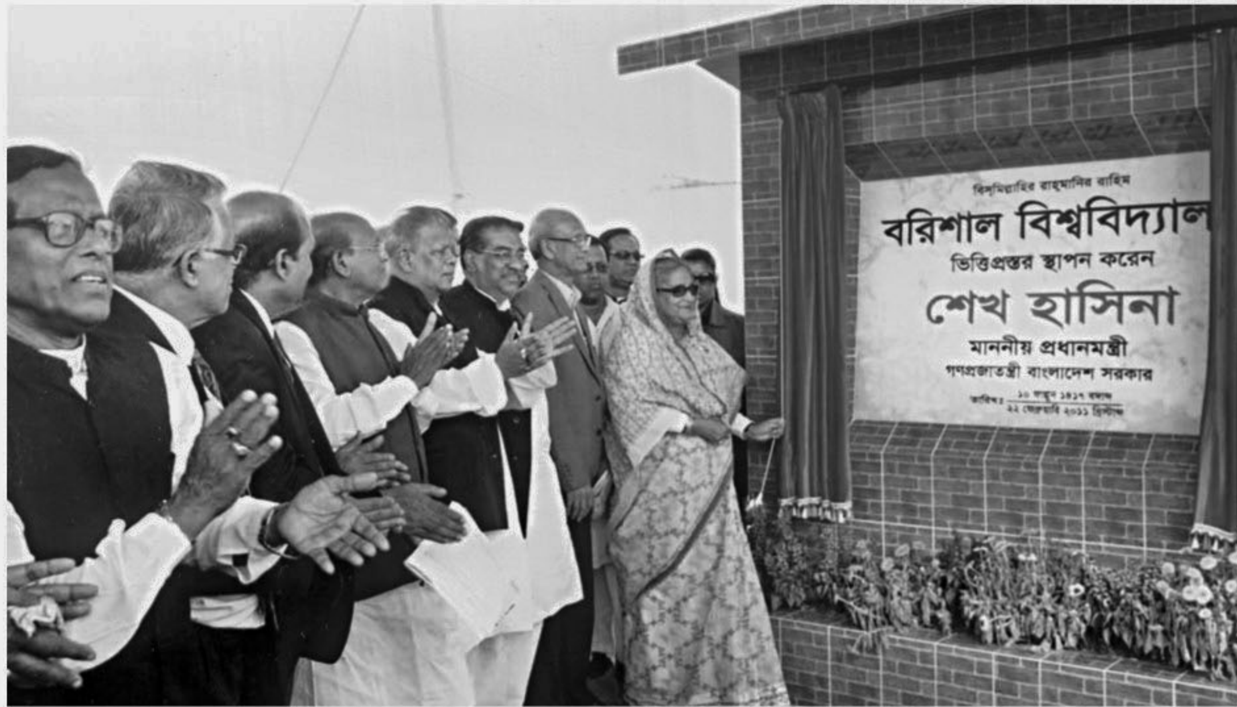
Prime Minister Sheikh Hasina inaugurates the foundation stone of Barisal University yesterday.

About the potentials of ship-breaking and ship-building industries in Barisal and other coastal areas, the prime minister said environment situation must be considered first in case of implementing any