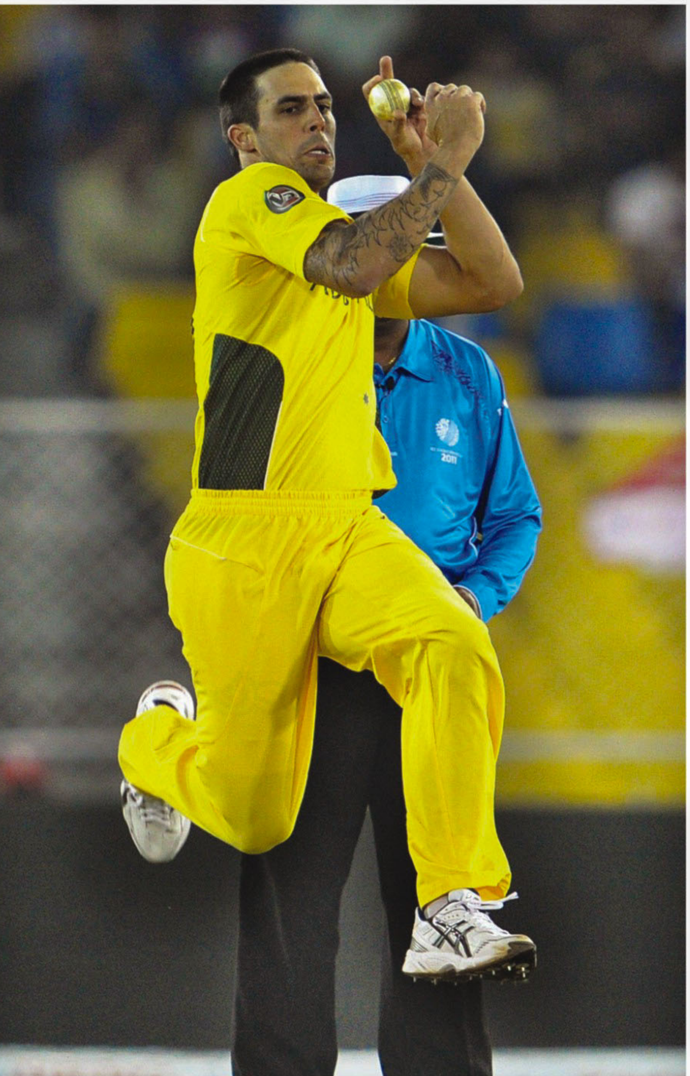
Australia paceman Mitchell Johnson is in his final delivery stride during the ICC World Cup match against Zimbabwe at the Sardar Patel Gujarat Stadium in Ahmedabad yeaterday. Johnson took 4 wickets for 19 runs.