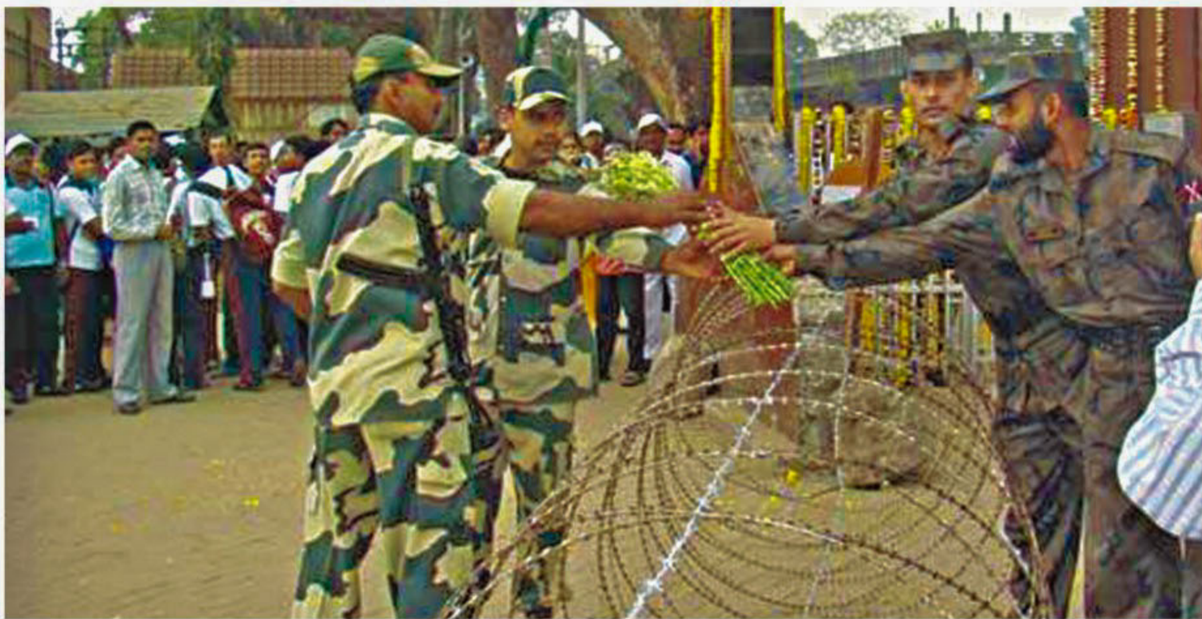
Border guards of Bangladesh and India greet each other with flowers marking the International Mother Language Day yesterday over the barbed wire fence on the territory line in Benapole.

trol of protesters. AFP reported that a suggestion in Brussels by British Foreign Secretary William Hague that Gaddafi might have left the country for Venezuela was swiftly denied by Caracas, home to the embattled Libyan leader's firebrand ally President Hugo Chavez. Two Libyan fighter pilots -- both colonels -- flew their single-seater Mirage F1 SEE PAGE 13 COL 1