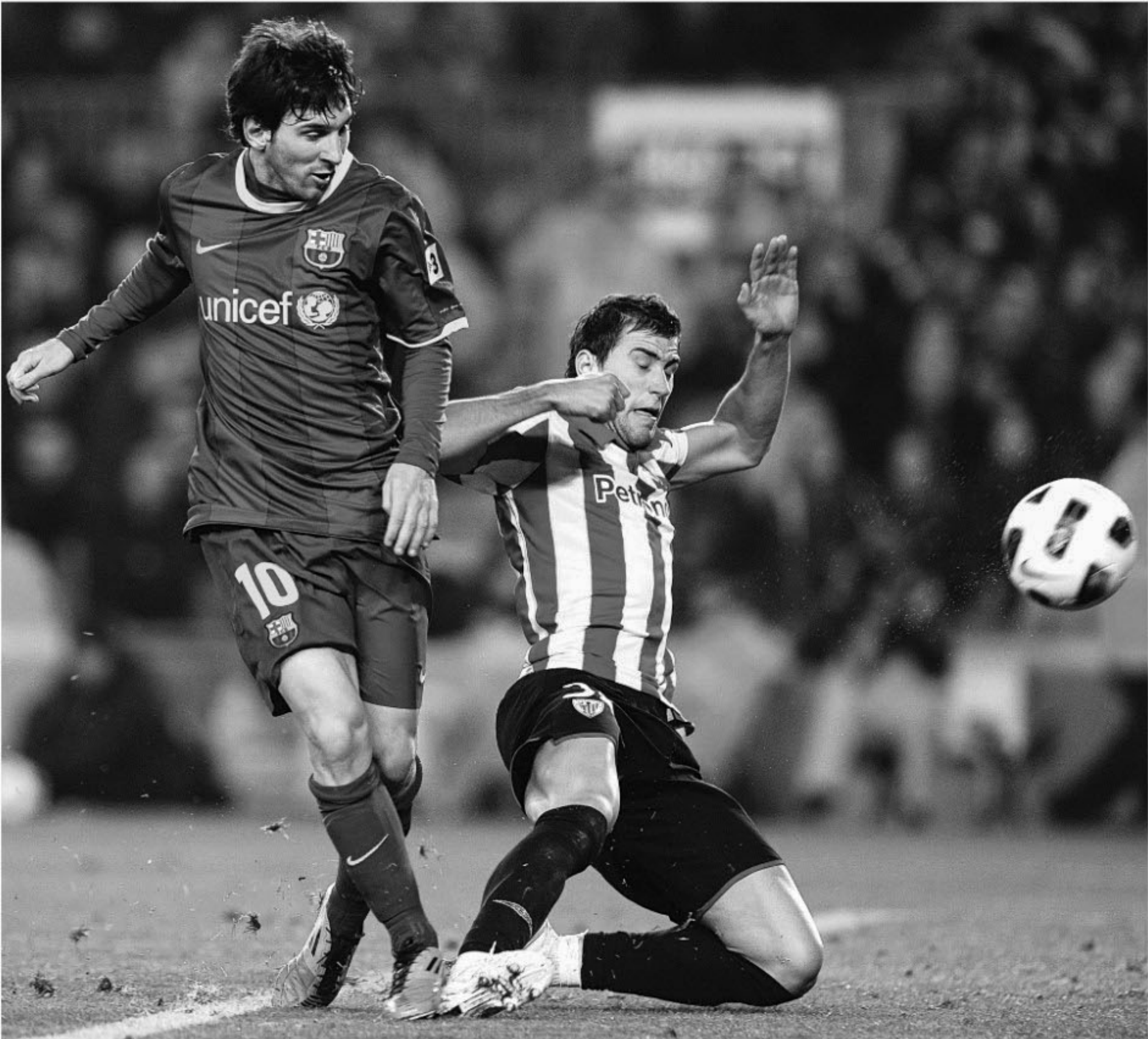
Barcelona sensation Lionel Messi (L) scores the winning goal against Athletic Bilbao during their Primera Liga clash at Nou Camp on Sunday.