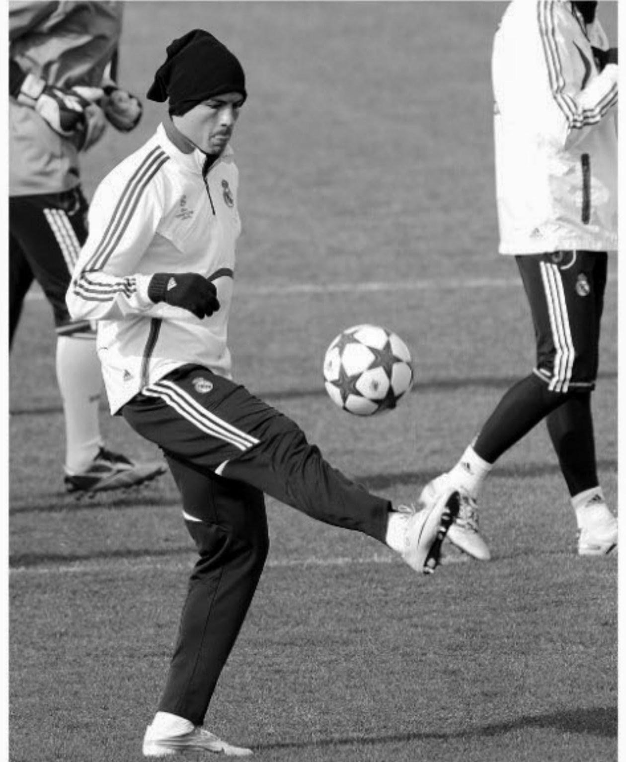
Real Madrid superstar Cristiano Ronaldo controls the ball during a training session at their Sport City yesterday on the eve of their Champions League encounter against Lyon.

Lyon won 4-0 at home to Nancy on Friday to keep their Ligue 1 title challenge on course, although coach Claude Puel knows Real -- currently second in the Spanish top flight -- are a very different prospect. Real won 2-0 at home to Levante on Saturday with Mesut Ozil, Xabi Alonso, and Emmanuel Adebayor on the bench and Mourinho confirmed that his big-name