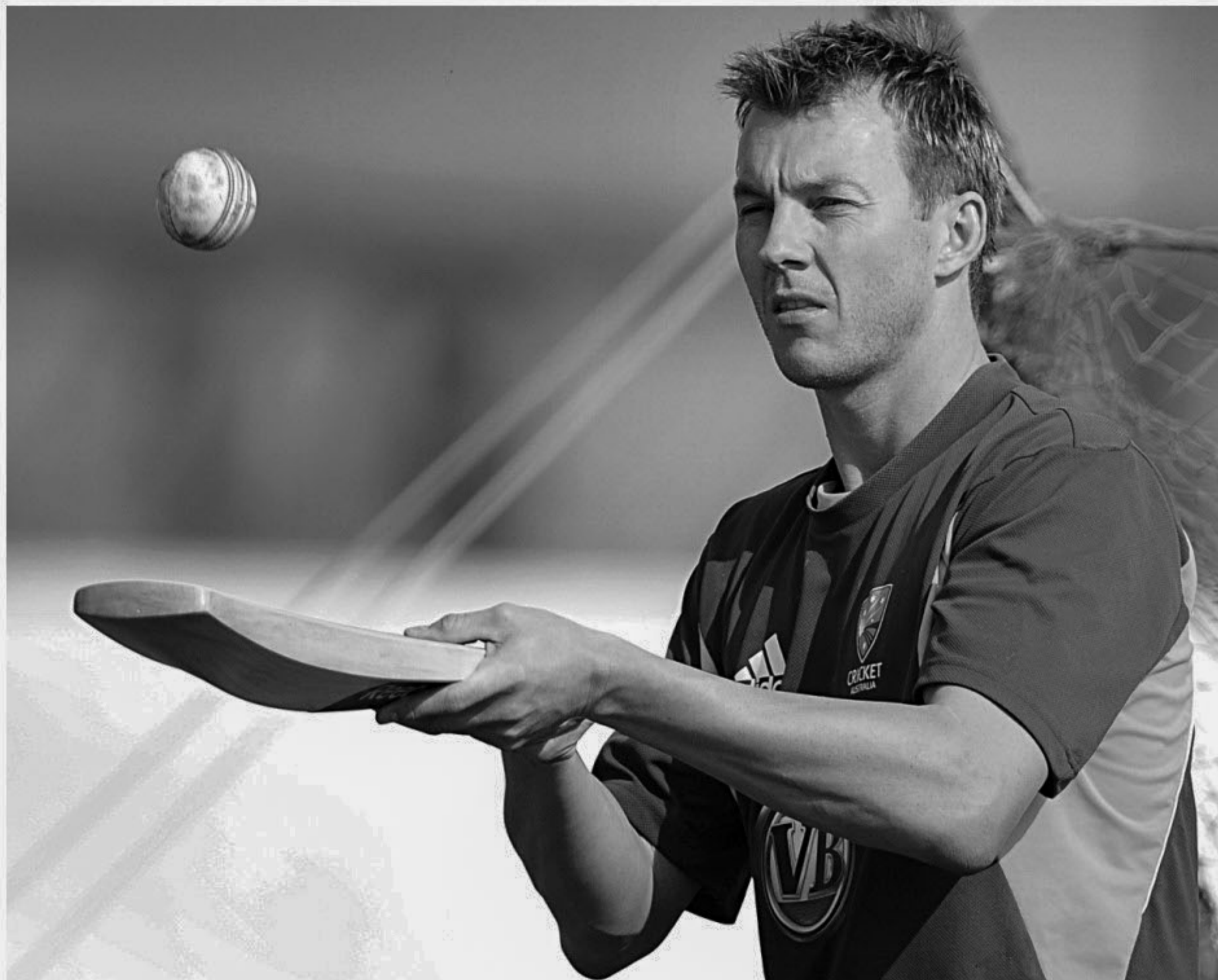
Australia pacer Brett Lee tests his balancing skills during a training session at the Sardar Patel Stadium in Ahmedabad on Friday. Australia are to face Zimbabwe in their first World Cup match today.