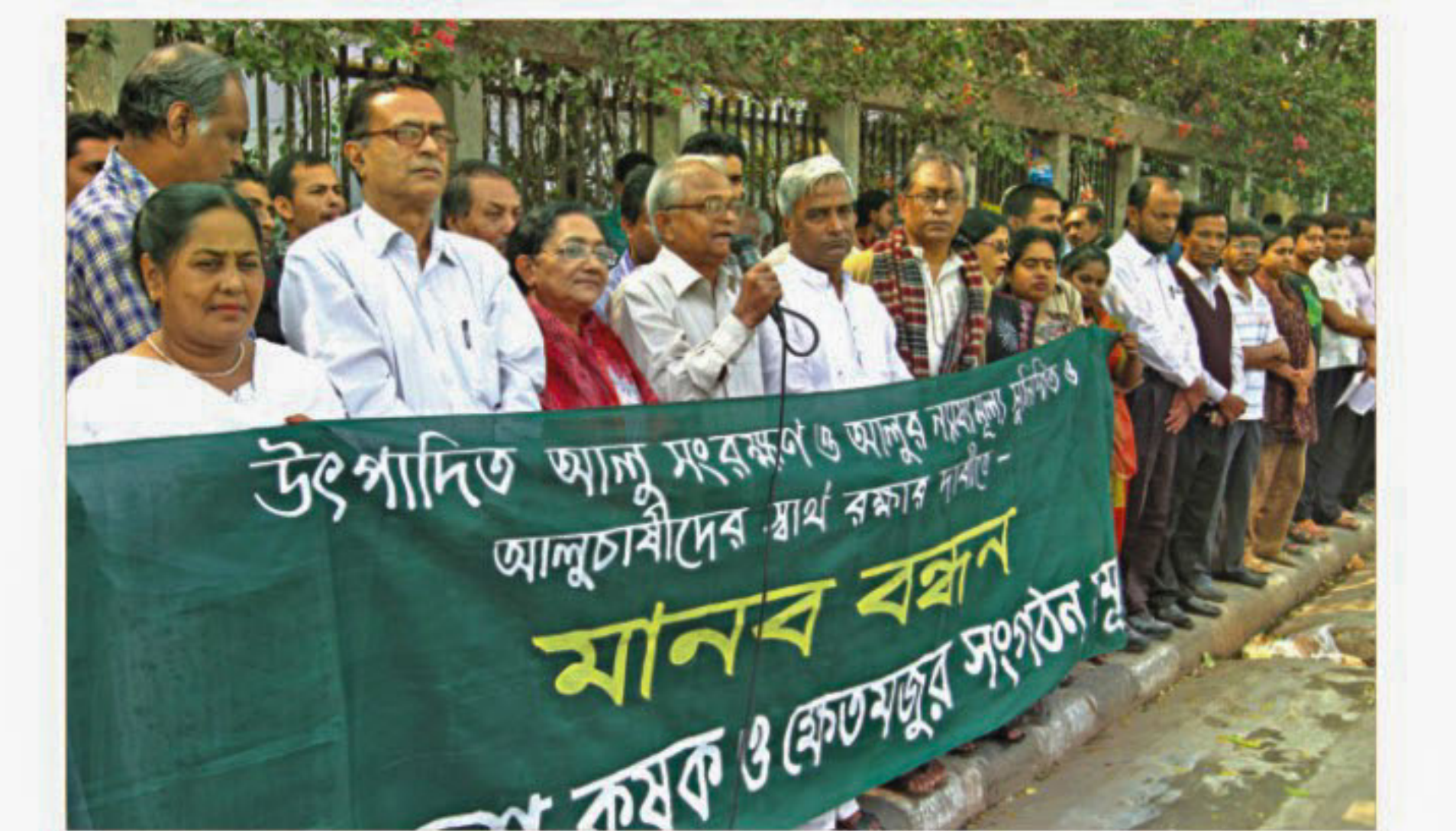
Bangladesh Krishak O Khetmojur Sangathan Samuho forms a human chain in front of the Jatiya Press Club in the city yesterday demanding to ensure proper preservation of this year's potato production and just price to the farmers to protect their interests.