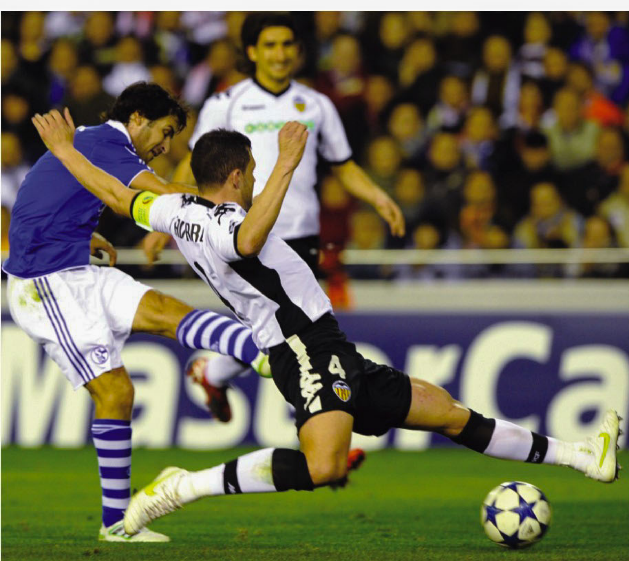
Schalke's veteran striker Raul (L) scores the equalising goal against Valencia during their Champions League second round clash at the Mestalla on Tuesday. With this goal Raul became the top marksman of all-time in European competition with 71 goals.

Substitute Marco Borriello directed a late header wide but Roma could not rescue a draw.