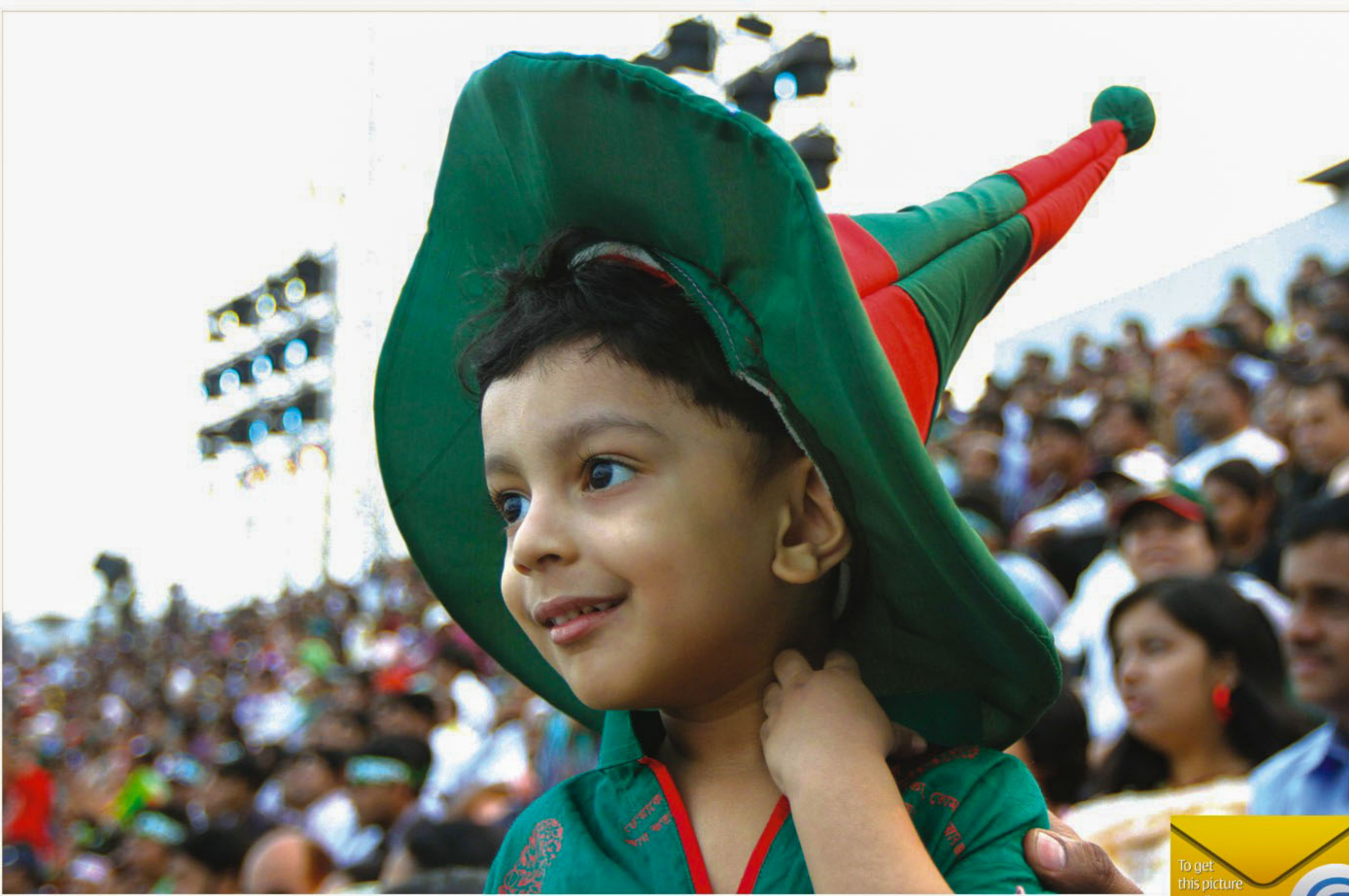
IN FANTASY LAND: A tiny tot watches the proceedings of the opening ceremony of the 2011 ICC Cricket World Cup with awe at the Bangabandhu National Stadium yesterday.

Everyone in this country wants to be here, and the lucky few should cherish it forever.