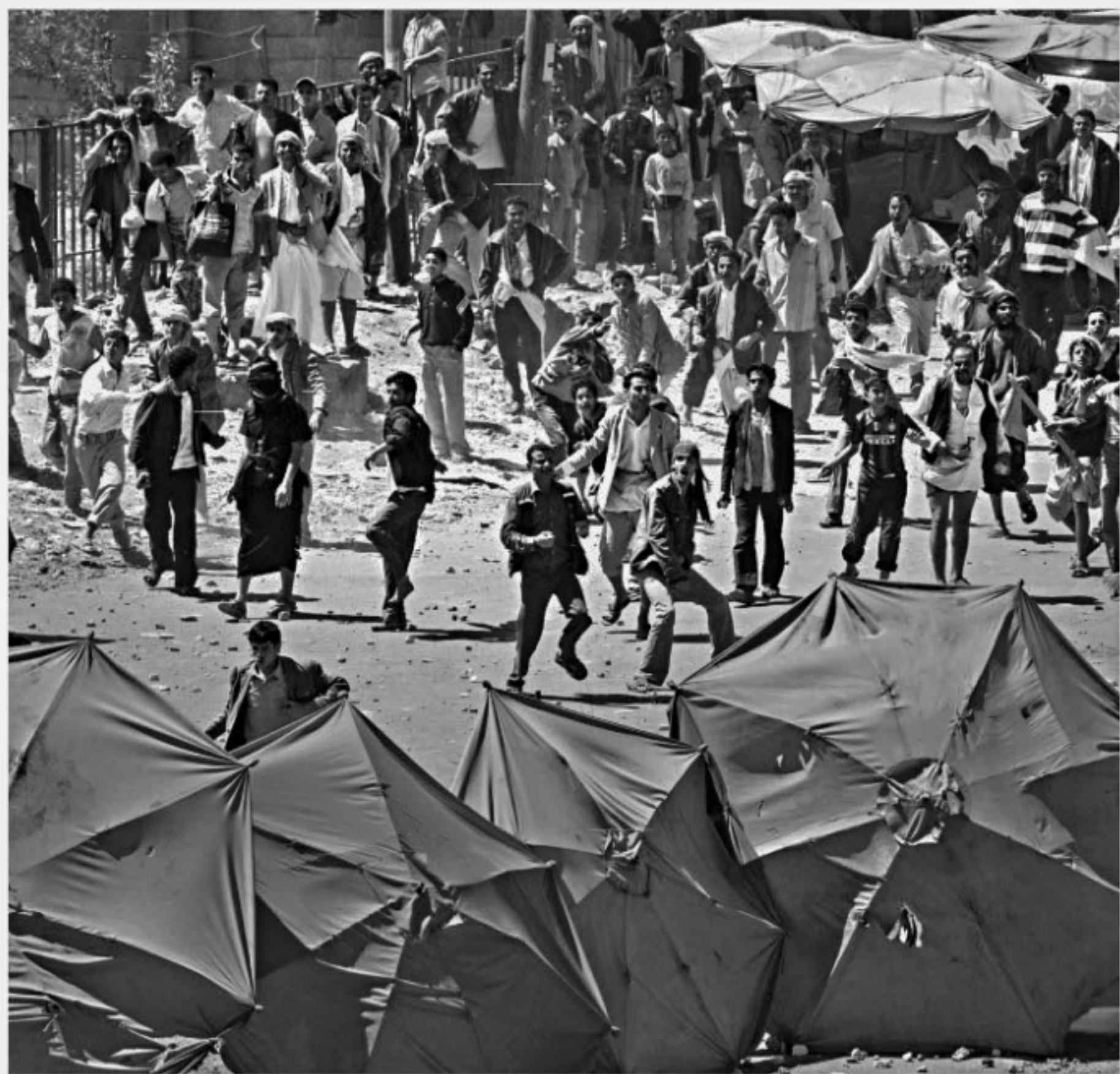
Yemeni regime loyalists throw stones towards anti-government protesters during clashes in central Sanaa yesterday. At least 25 people were injured while police fired warning shots during the fierce clashes, an AFP reporter said.

The protesters, chanting "The people want to overthrow the regime," responded by hurling stones.