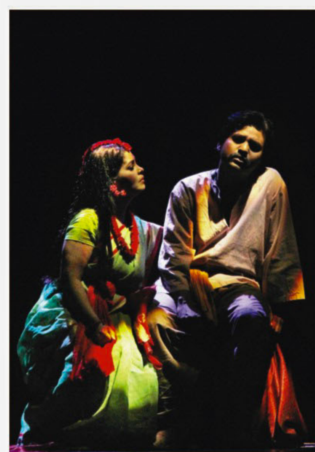
Scenes from "Rakto Karobi" (left) and "Tasher Desh".

The organising troupe, Prangane Mor staged its popular play "Rakto Karobi" at the National Theatre Hall. Loko Natyadal staged two plays -- "Chandalika" and "Tasher Desh" -- at the Studio Theatre Hall.