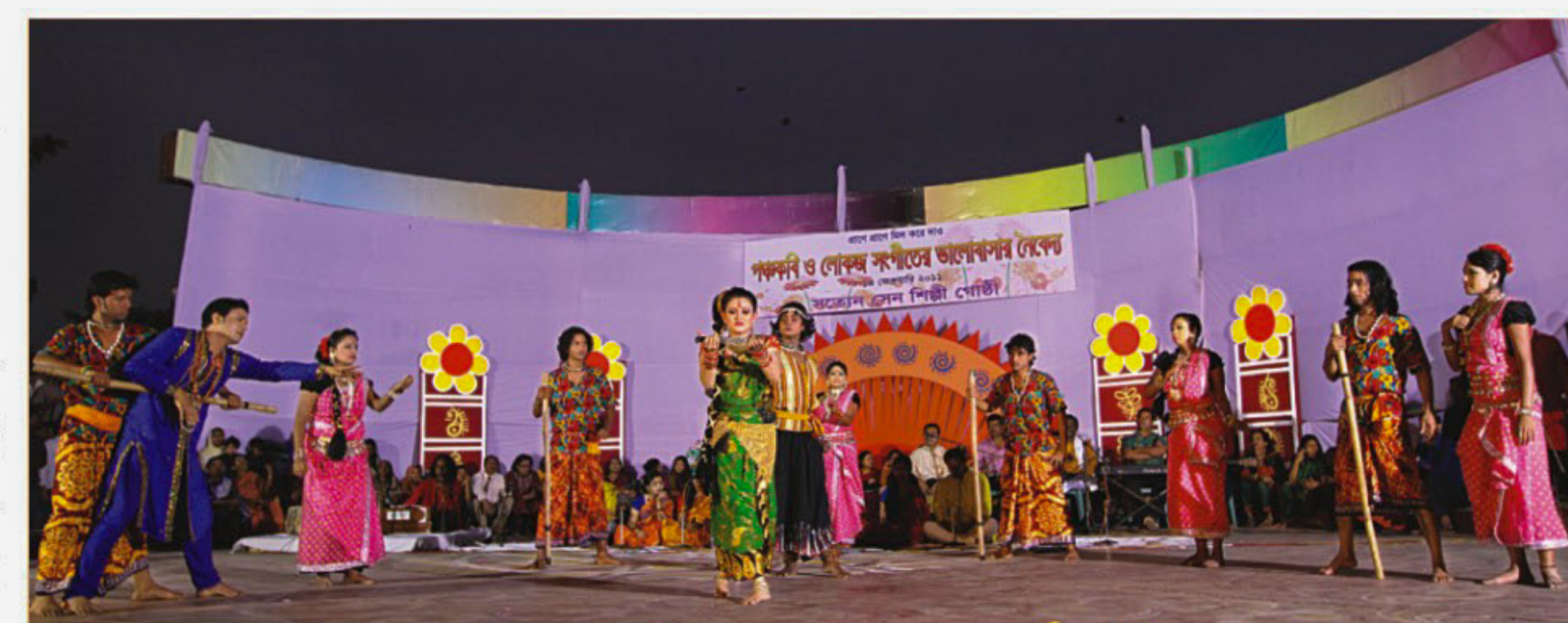
Artistes of Mukul Nriy Kala Shanghona of Manikganj perform "Mohuar Pala" at the festival.