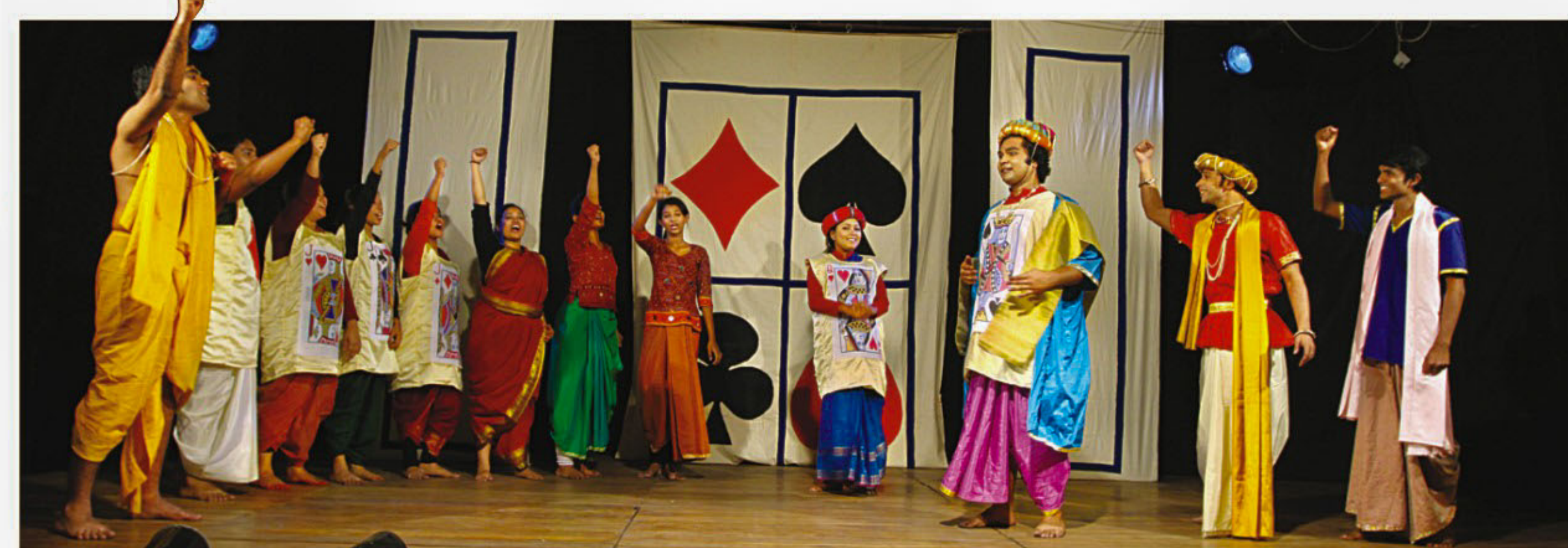
Scenes from "Rakto Karobi" (left) and "Tasher Desh".

Today, Rangokormi (India) will stage another adaptation of "Chandalika" at the National Theatre Hall, while Shobdabali (from Barisal) will stage "Elong Birpurush".