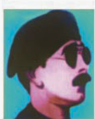
Bangladesh Air Force (BFA) yesterday observed the 42nd death anniversary of Sergeant Zahurul Haque with due solemnity.

On this day in 1969, Zahurul was killed by the Pakistani Army when he was detained in the Dhaka Cantonment in connection with the Agartala conspiracy case.