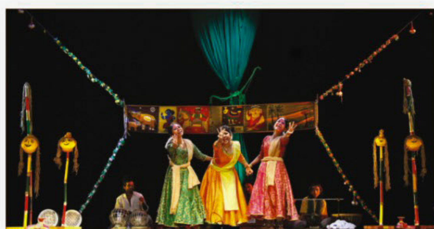
A scene from "Nana Rangey Robi."