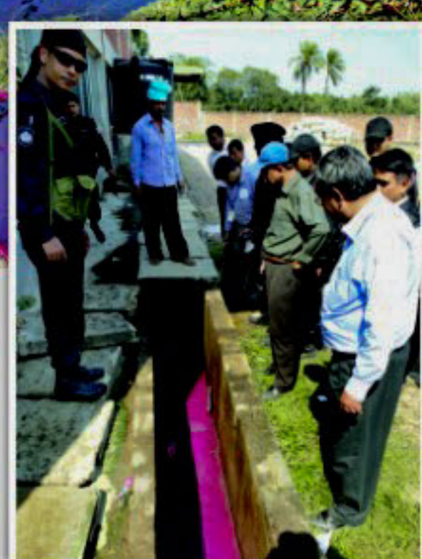
Toxic liquid released from the Mozart Knit Ltd at Savar. Inset, A Department of Environment team examines the Simtex Industries Limited's Effluent Treatment Plant which was found shut yesterday. The team along with Rab members at Mozart Knit inspect a drain through which huge toxic waste is discharged into nature.