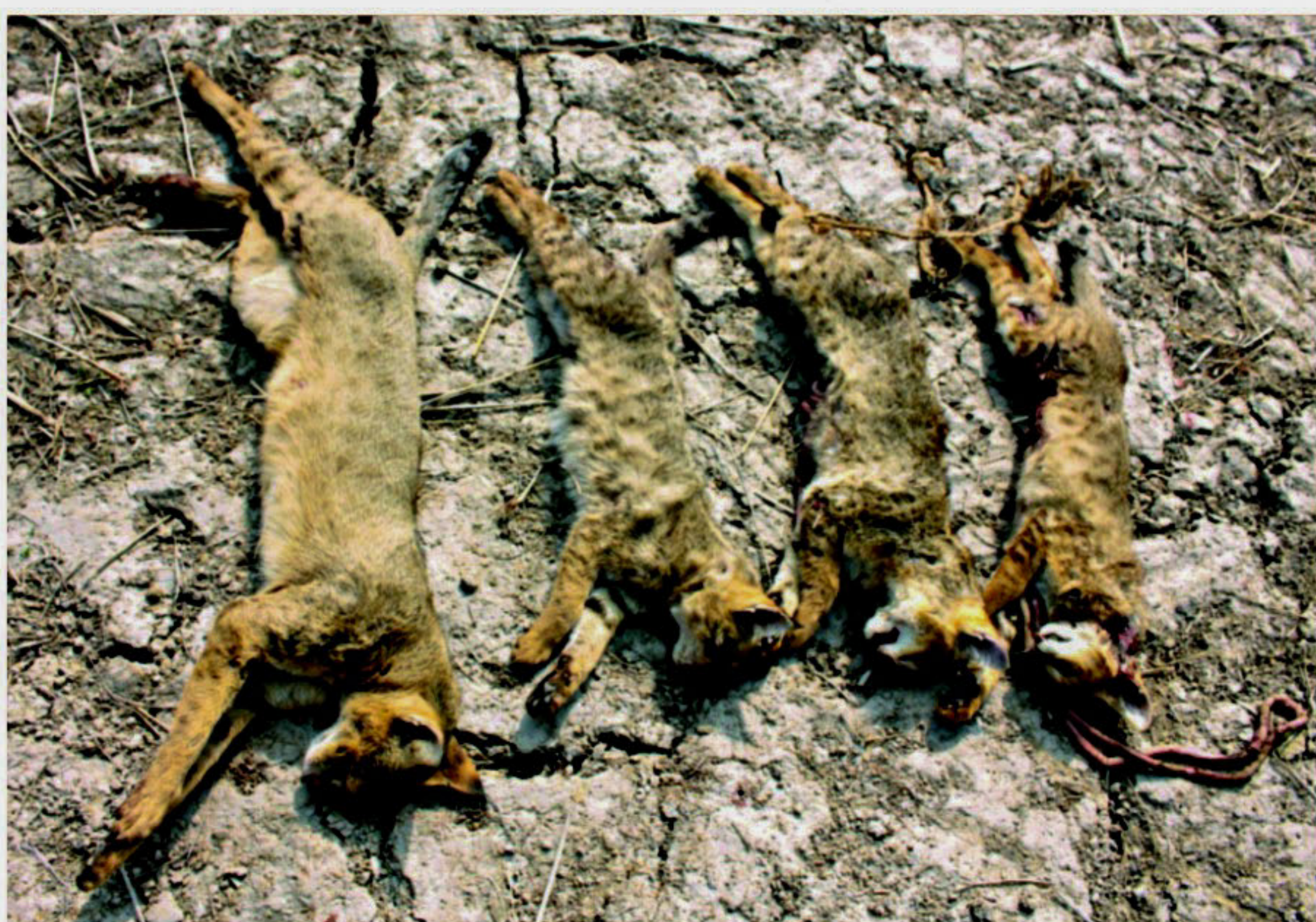
Jungle cats are rated endangered by IUCN Bangladesh and yet four of them -- a mother and her three cubs -- were beaten to death by villagers in Hail Haor area last weekend. Their crime -- they would sometimes prey on domestic poultry. The cabinet just approved the Wildlife Act last week. But it would do little to save the animals until a comprehensive plan is taken to reduce wildlife-human conflict. As long as the cats would feed on poultry, villagers would consider these beautiful animals as pests.