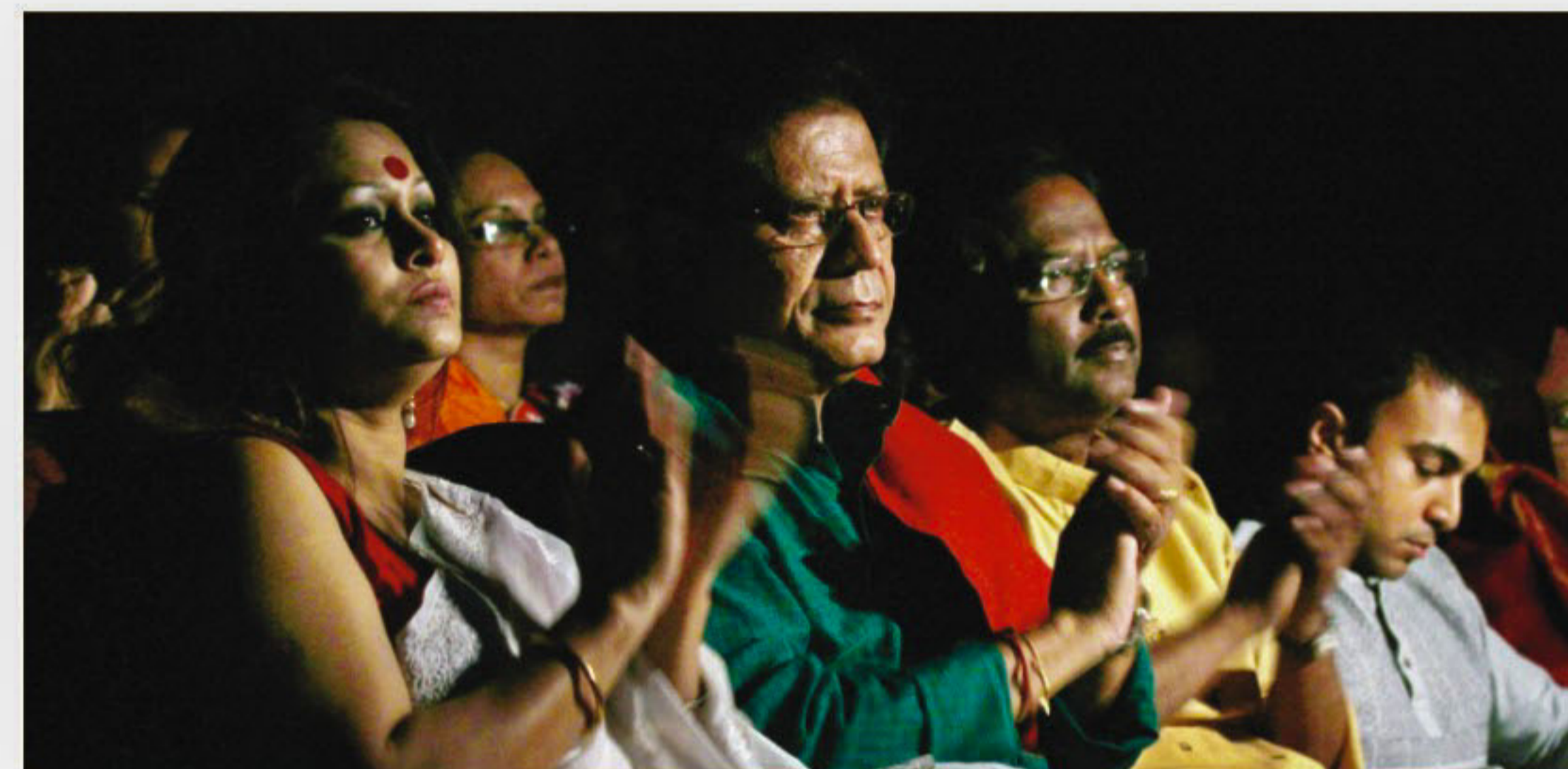
A view of the audience.