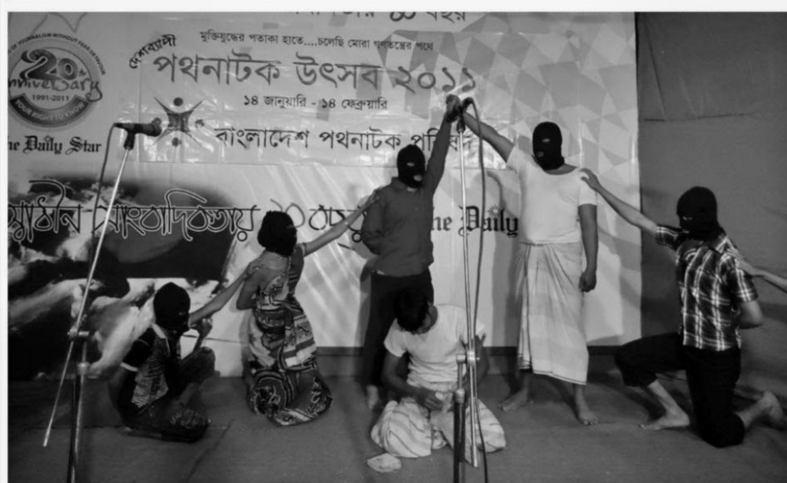
Artistes of Darpan Sangkritik Gosthi stage street drama Swadhinatar Dirghaswash in Pabna town on Friday as The daily Star and Bangladesh Pathanatak Parishad jointly organised the programme marking 20th anniversary of the daily and 40th anniversary of the country's independence.