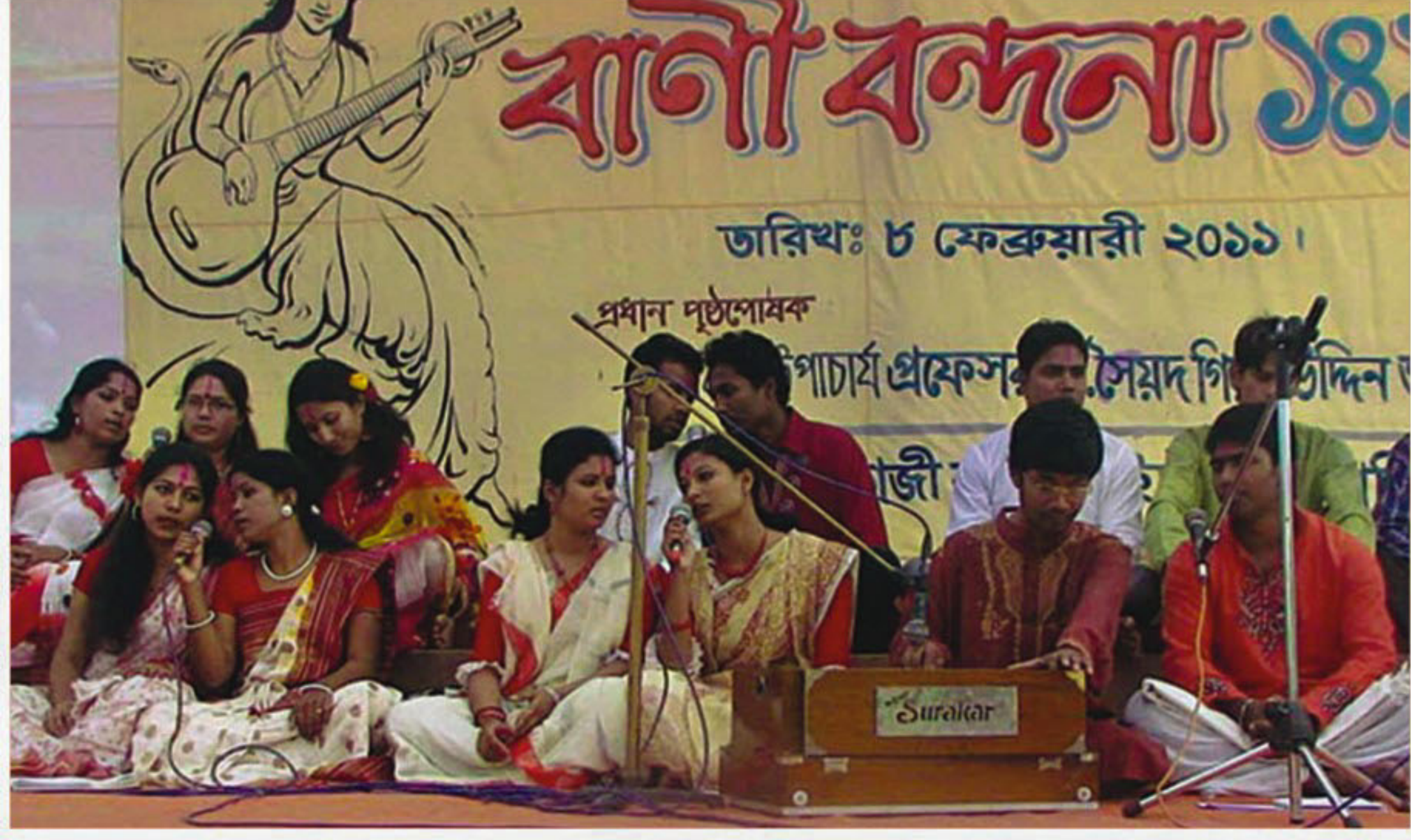
Students of Jatiya Kabi Kazi Nazrul Islam University sing at the cultural programme on the occasion (left).