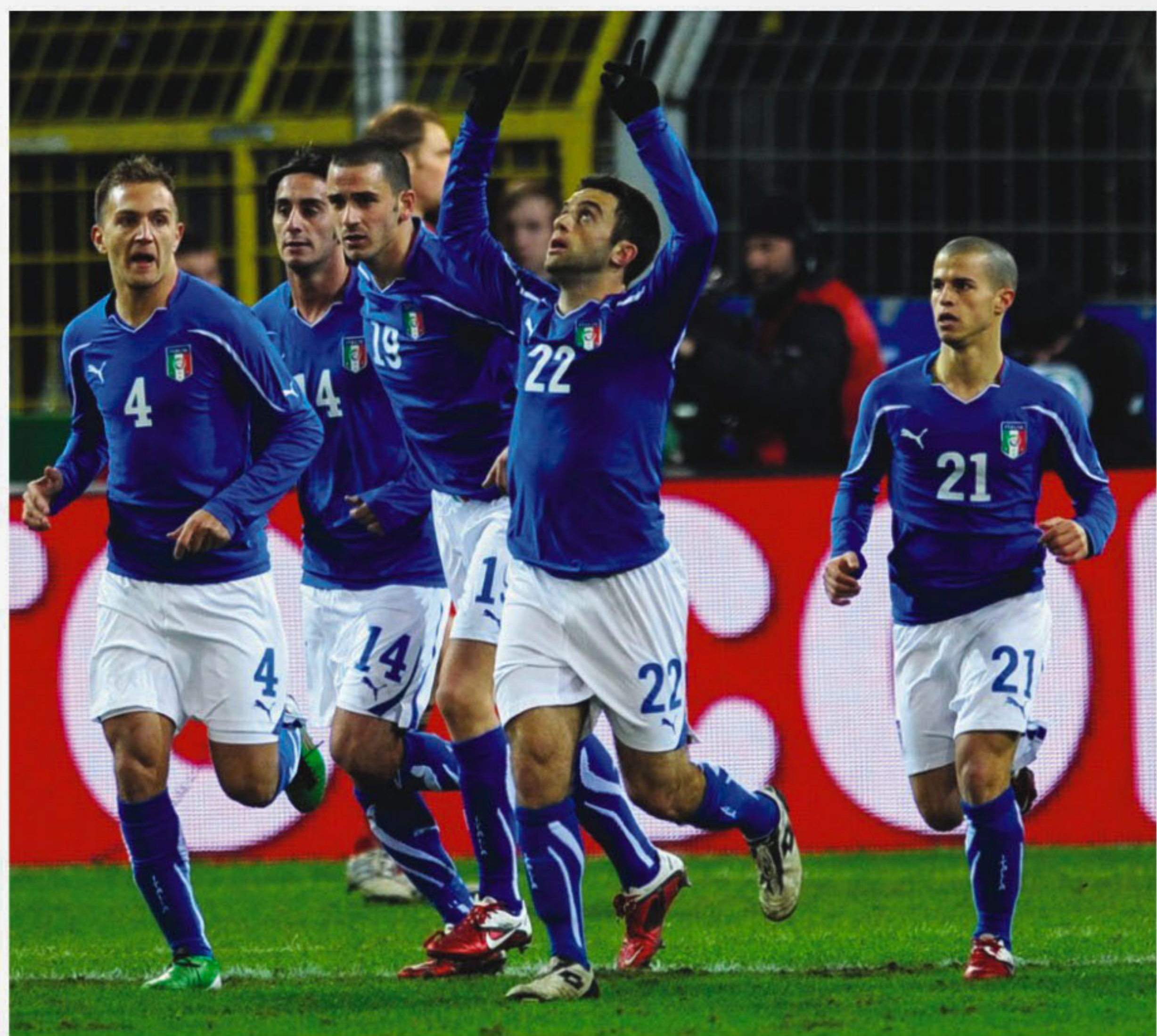
Italy striker Giuseppe Rossi (2nd from R) celebrates his equalising goal with teammates during their international friendly in Dortmund on Wednesday.

"It didn't work out, but I trust in the fact that we will be able to beat Italy once again in the future."