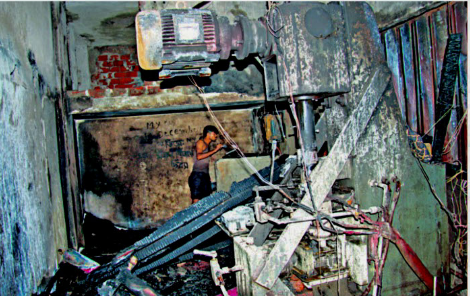
The burnt machinery of the shoe factory at Islambagh in Old Dhaka yesterday.