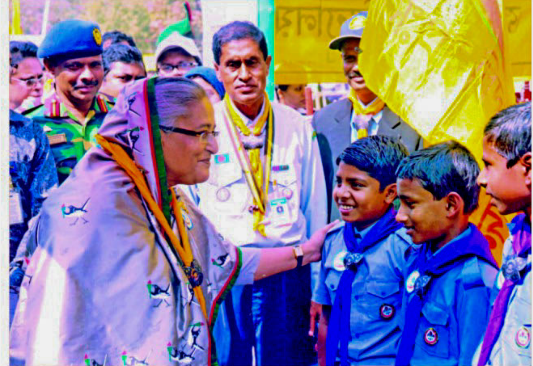
Prime Minister Sheikh Hasina talks to cub scouts after inaugurating 7th National Cub Camporee at Mouchak National Scout in Gazipur yesterday.

"We suspected two men when they were crossing the customs with two luggage around 10:00pm. After inspection, we found the currency," Rahman told The Daily Star. The other man fled immediately, he said.