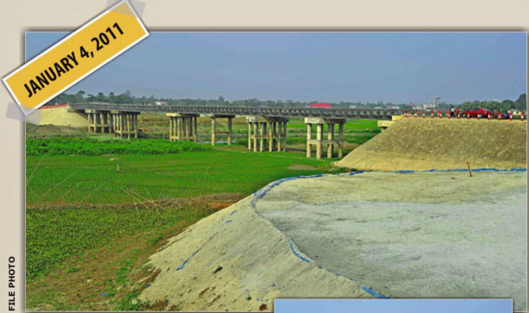
The top photo shows the now-completed low bridge over the Turag River connecting the Pratyasha housing estate, near Kamarpara, and land grabbers have moved in to grab river land. The inset photo shows temporary fences that are being used on the other side of the river to occupy land.