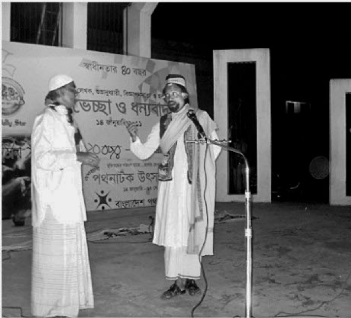
Drama circle Ityadi and The Daily Star jointly staged two street dramas titled 'Aloy Fera' and 'Kushumer Joi' in Patuakhali town yesterday marking the 40th anniversary of Bangladesh's independence as well as the 20th anniversary of the newspaper.