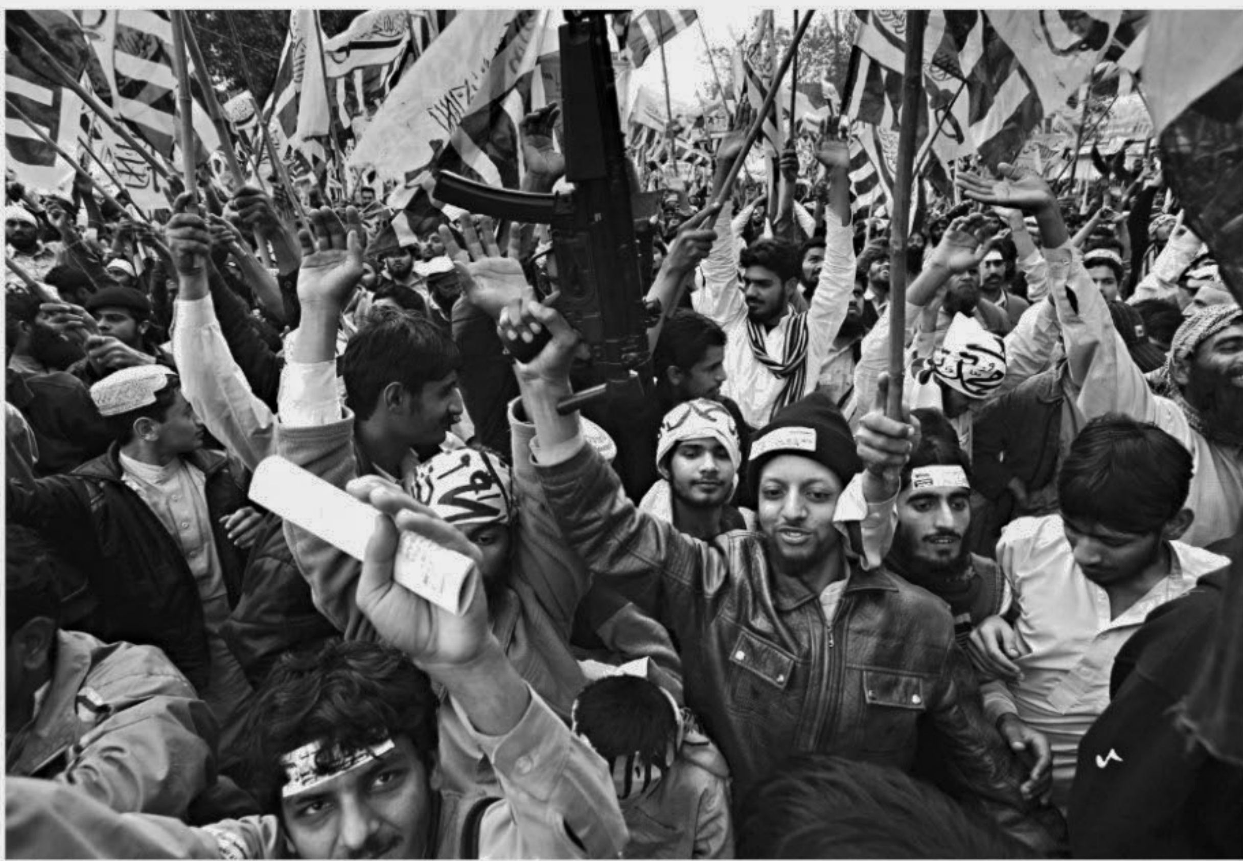
Thousands of people rallied across Pakistan yesterday to denounce Indian rule in Kashmir, the disputed Muslim-majority Himalayan state divided between the nuclear-armed rivals.

India suspended a peace dialogue with Pakistan in the wake of the November 2008 Mumbai attacks, which claimed 166 lives, but the two countries last year began to explore a resumption of structured talks.