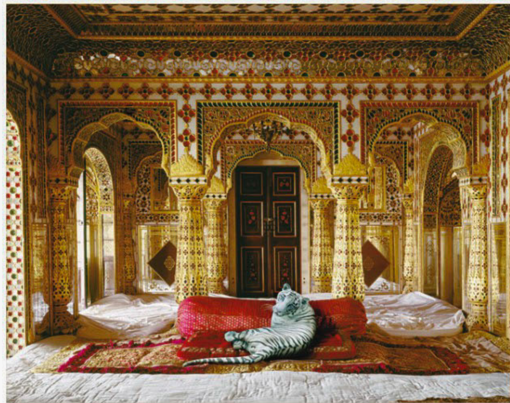
The Peacemaker by Karen Knorr.

The largest exhibition of the festival was at BSA. Works of internationally recognised photographers like Bronek