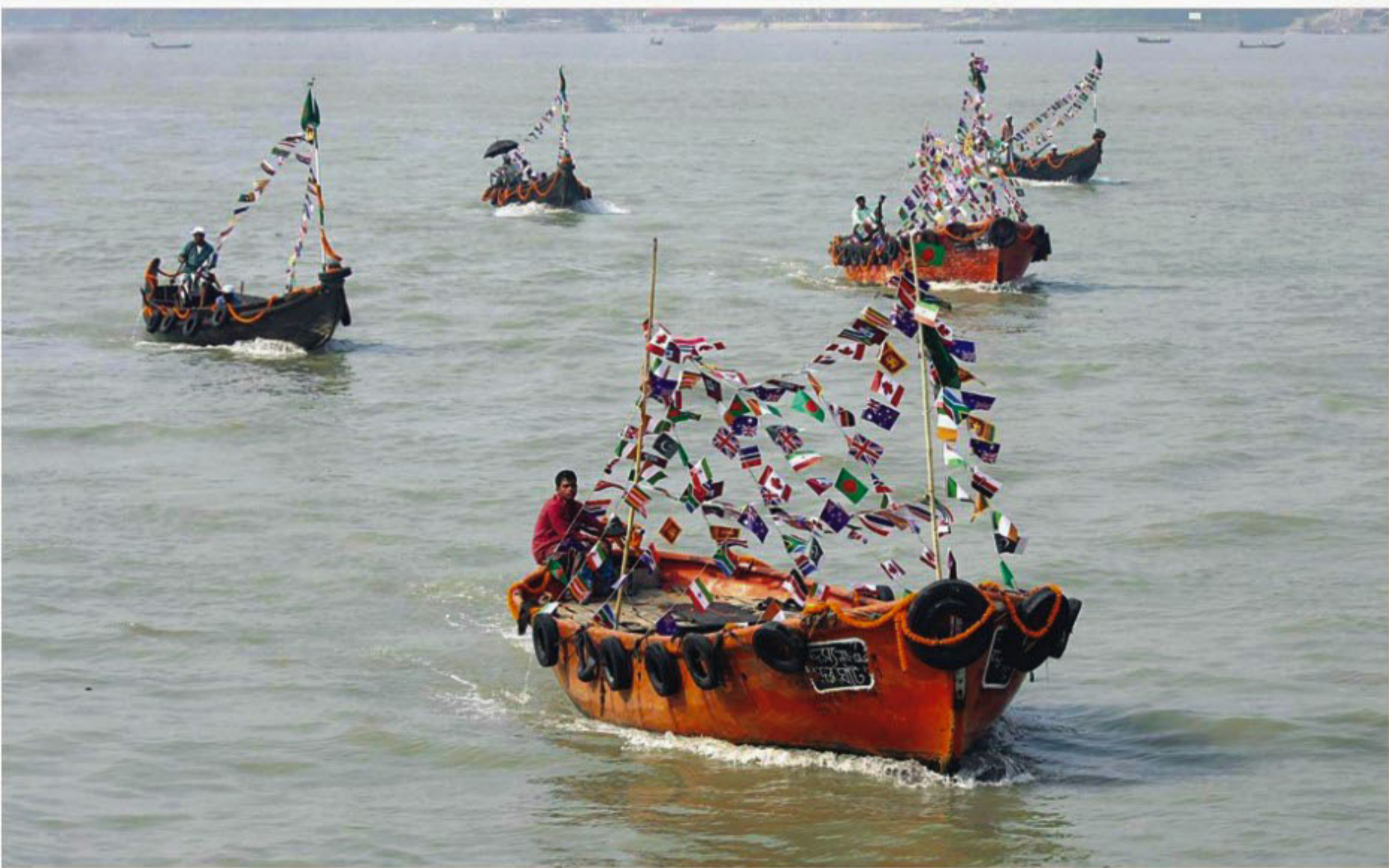
Scenes from the boat rally organised by the City Corporation of Chittagong to arouse excitement among the city dwellers for the World Cup beginning in the country on February 17.