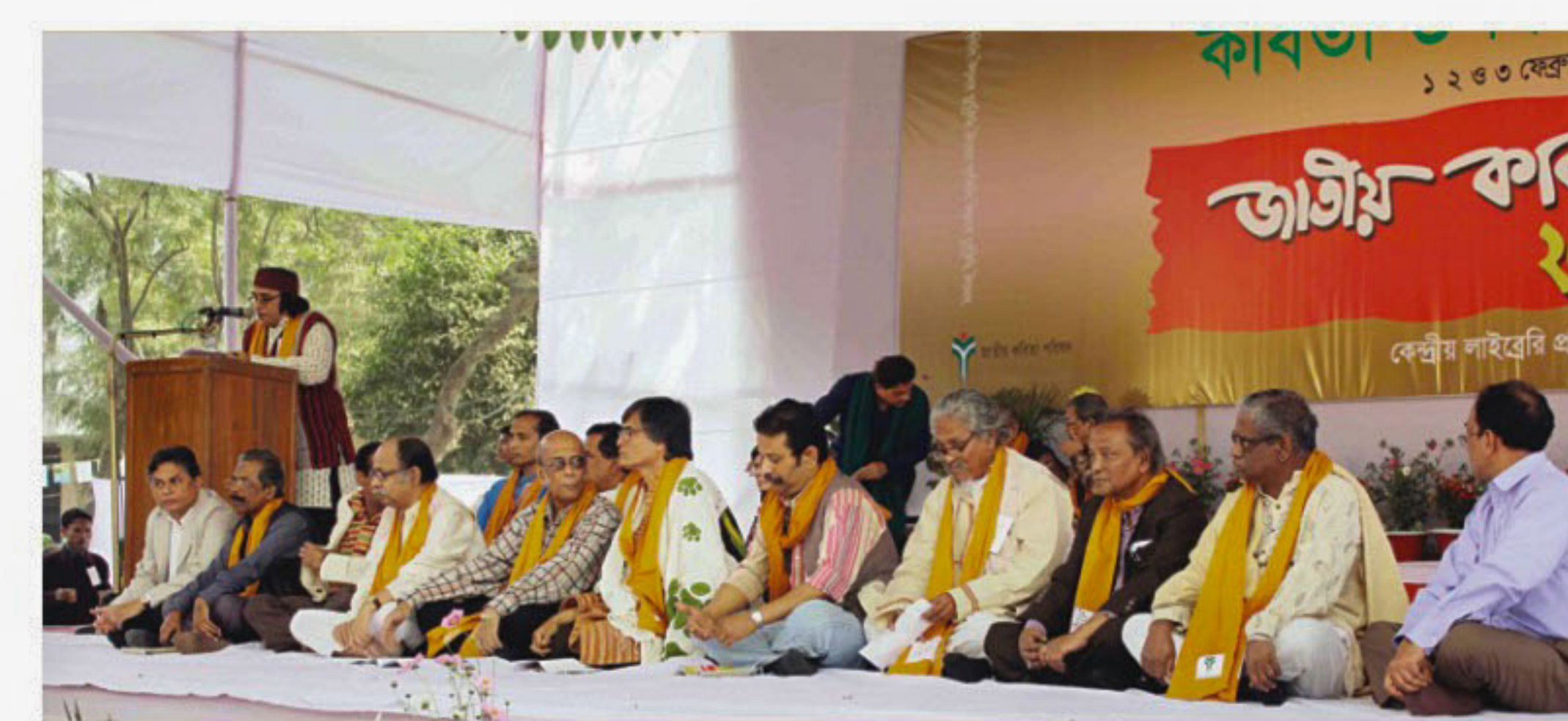
Presided over by eminent poets and personalities, four phases of recitation programmes were held at yesterday's session.