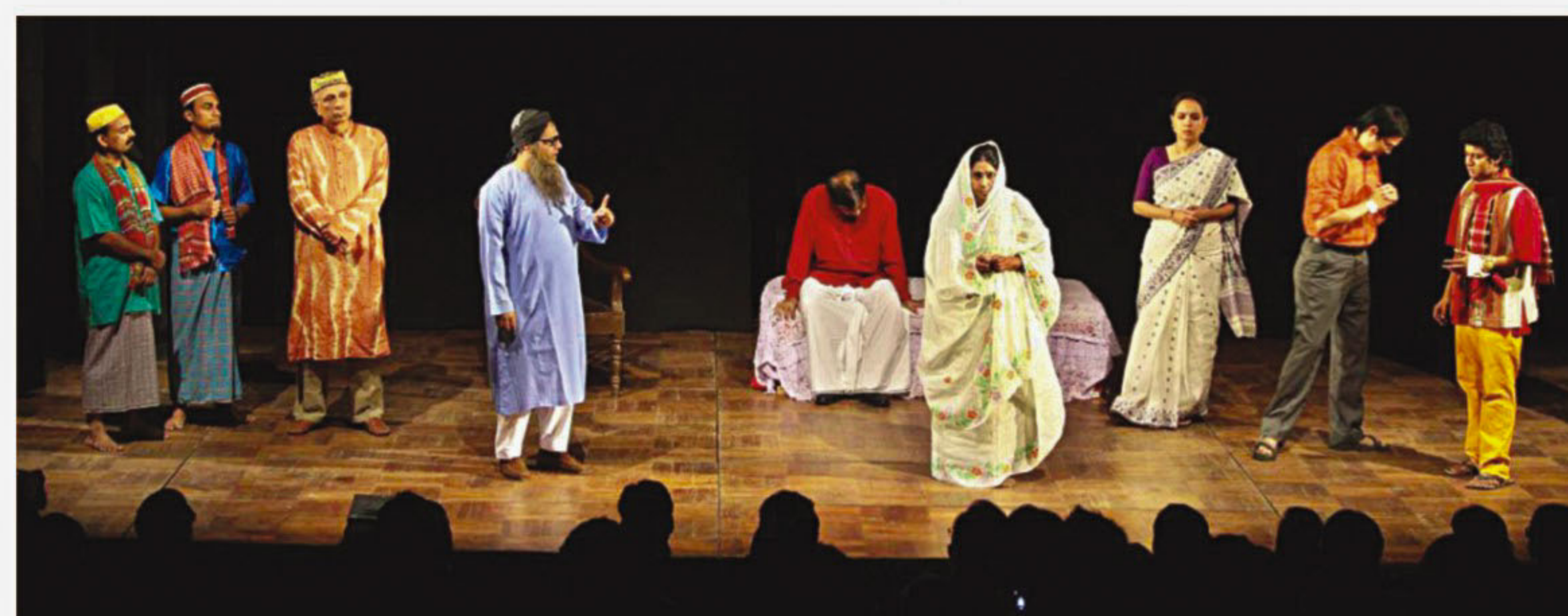
Clockwise (from top) Scenes from "Meraj Fakirer Ma", "Badnam" and "Majh Rater Manushera".