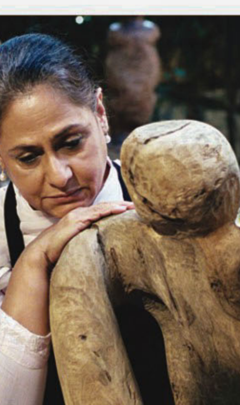
A scene from the film.