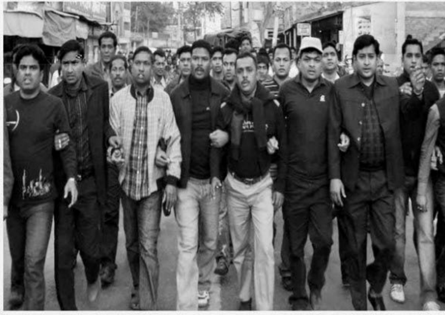
BNP takes out processions in Munshiganj and Natore district headquarters yesterday protesting filing of a case against party chairperson Khaleda Zia, accusing her of instigating Monday's clashes in Munshiganj.