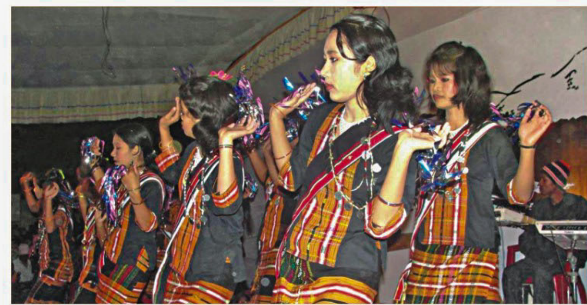
Indigenous Mro artists perform a traditional dance during the royal festival at Rajbari Compound.