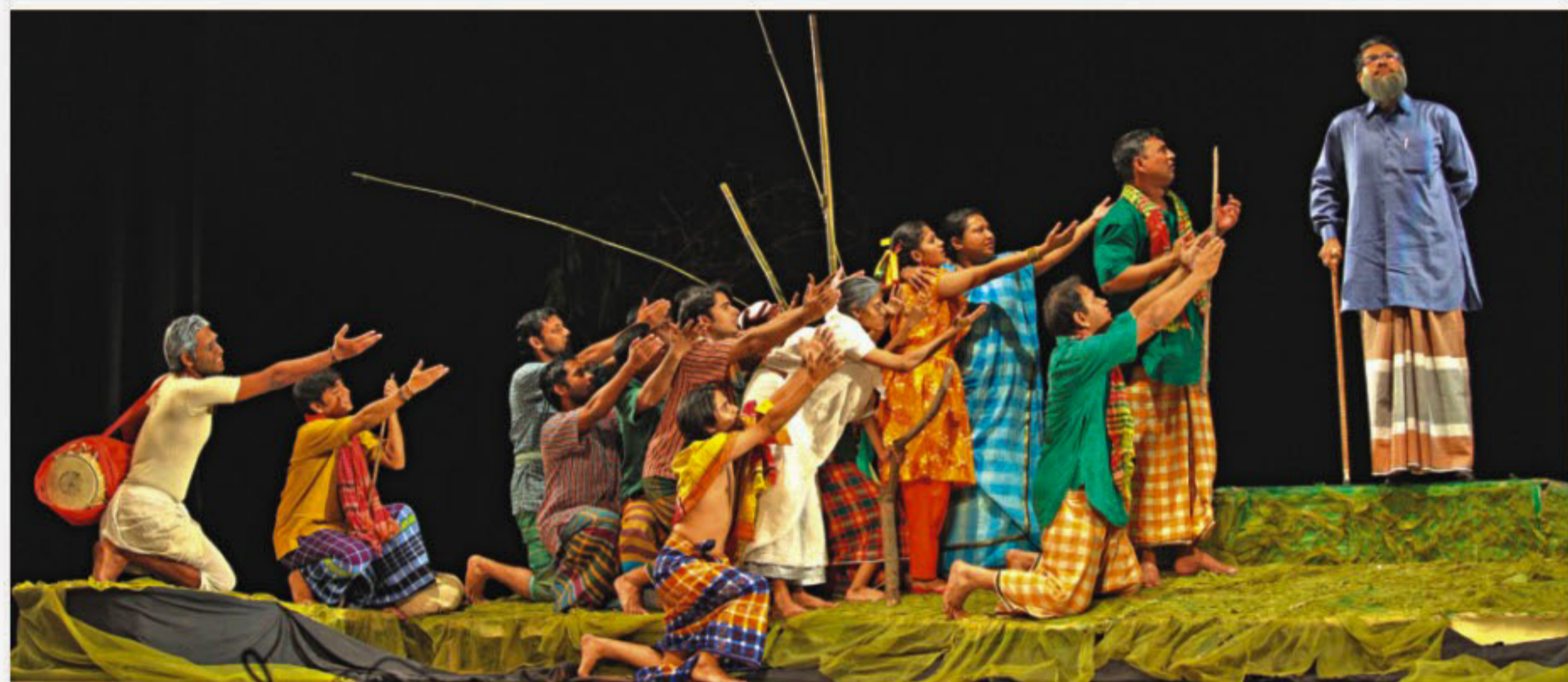
Clockwise from top: Scenes from "Binodini", "Jol Balika" and "Magaj Shamachar".