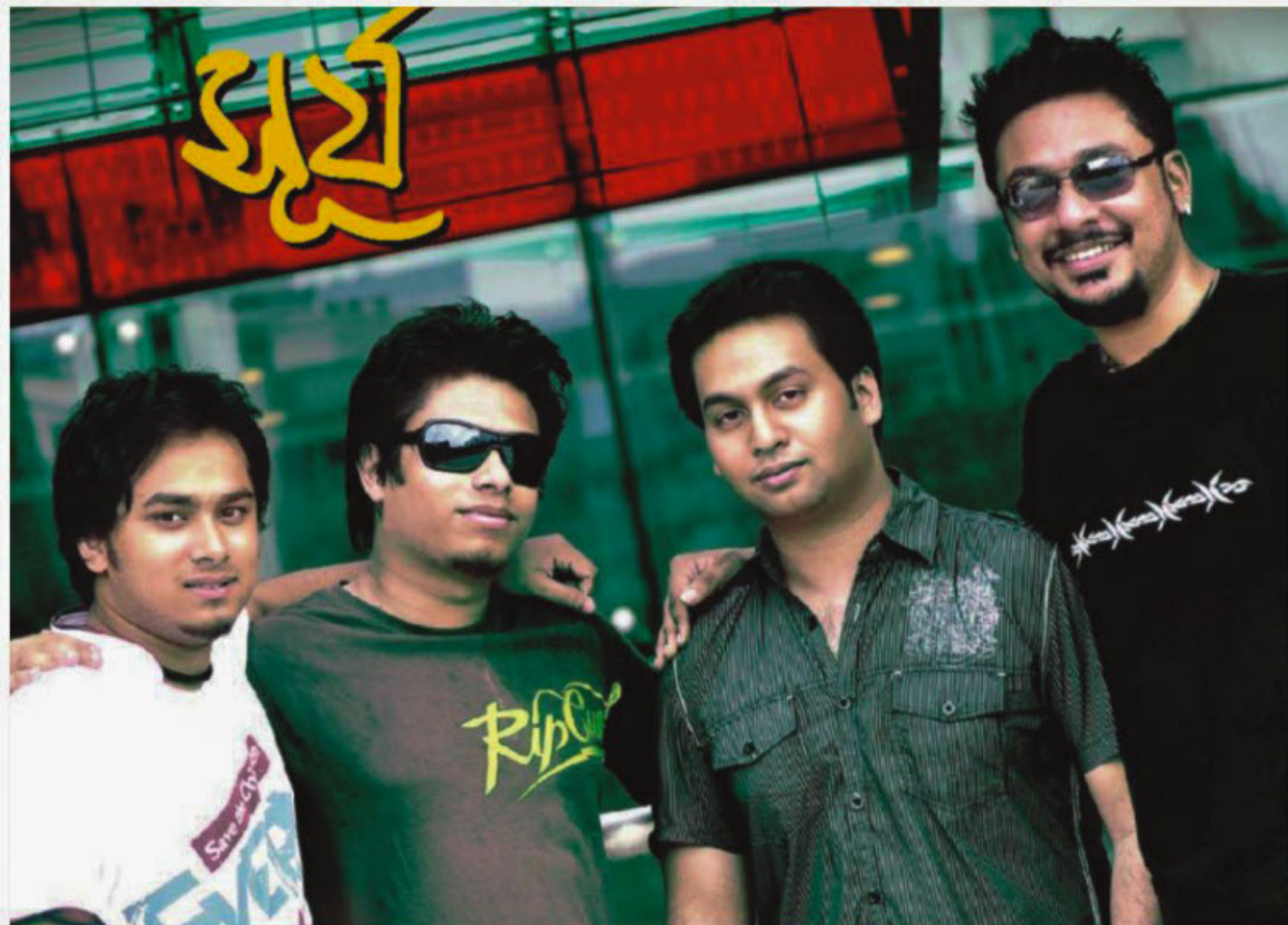
Bohemian fans can very soon enjoy a new number from the band.